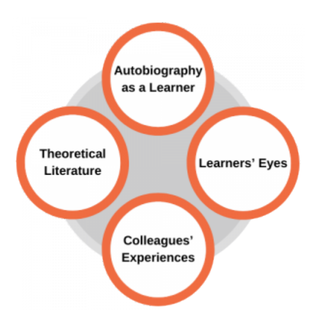
Figure 1. Brookfield's (1998) Lenses

We, as educators, need to take the time to work the reflective process into our professional practice as the intentionality of the reflective process is critical for success. While it may be easy to recommend that teachers become reflective practitioners (Schön, 1987), we concur that the tactical approach of incorporating critical reflection is challenging. Most teachers would likely feel that they reflect on their teaching at some point in their day, but there are some interesting and practical ways to be truly intentional about the process. We suggest Brookfield's (1998) Lenses (Figure 1) as a concise framework and offer further opportunities in the activities section following.