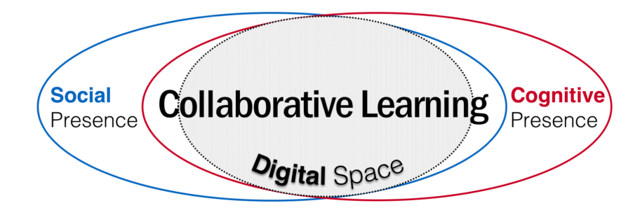
Figure 1 . Framework for community (FOLC) van Oostveen et al 2016

nities. The main difference between these two models is that the FOLC model sees all community members as learners; as such, there is no direct teacher presence since learning is co-designed and collaboratively generated.