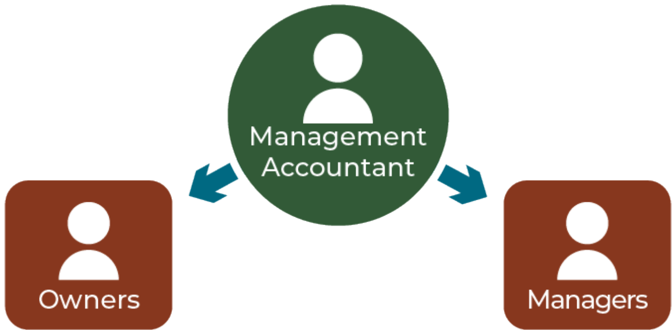
“Role of Managerial Accounting”

out their responsibilities. Because the information it provides is intended for use by people performing a wide variety of jobs, the format for reporting it is flexible. Reports are tailored to the needs of individual managers and are intended to provide relevant, accurate, and timely information that will aid managers in making decisions. In preparing, analyzing, and communicating such information, accountants work with individuals from all the functional areas of the organization—human resources, operations (golf services, turf, food and beverage), marketing, etc.