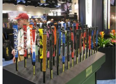
“Golf Grips”

One of the basic steps is understanding the material costs and how much to sell your service.