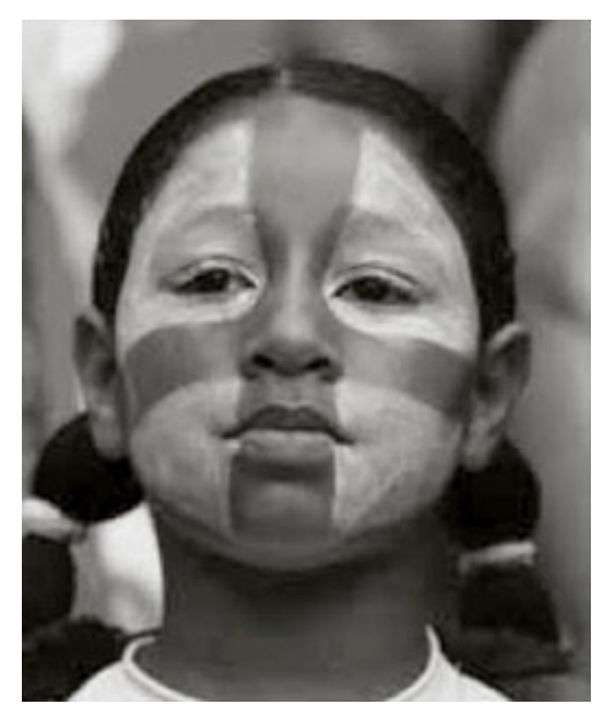
Figure 2 An expression of the English nation: a young football fan watches England v. Iceland Long description

We can see that the problem with so-called objective approaches to defining a nation is finding sound criteria by which one might judge which groups form nations and which do not. How can we weigh different histories, traditions, religions, languages? Any attempt at objective demarcation of national communities is sure to remain contested, not least from among the groups who are thus classified.