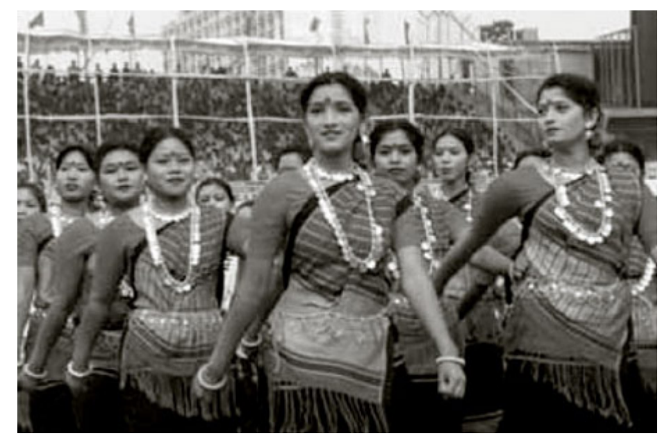
Figure 5 Celebration of a nation: Bangladeshi women parade at a ceremony celebrating the thirtieth anniversary of the declaration of independence from Pakistan, March 2001 Long description

• (c) Regional and global community? It is a source of irony for some commentators that a resurgence of nationalism after the collapse of communism in Russia and in Eastern Europe has come at a time when the primacy of the nation-state in some key respects is being challenged by something called 'globalisation' (see Gieben and Lewis, 2005; Guibernau, 2005). According to some influential views, globalisation does involve large-scale trends which add up to a significant challenge to our dominant national conceptions of political community. David Held (2000) has recommended that we adapt democracy so that new 'constituencies' that cross national boundaries can be recognised and their members participate in decision making on cross-border issues. He and others have also advocated global government through a world parliament and other institutions. Such views see the community as made up of those affected by certain actions or phenomena, regardless of their territorial location and loyalties. It is people affected by, for example, AIDS, acid rain and global warming, who form a new sort of 'constituency' and a new type of collective interest. The concern here is about people in different countries, drawn together in new forms of 'political community' by having a stake in the outcome of pressing cross-border issues, and the need to downgrade more rigidly national-territorial (and to some degree also legal) definitions of political community.