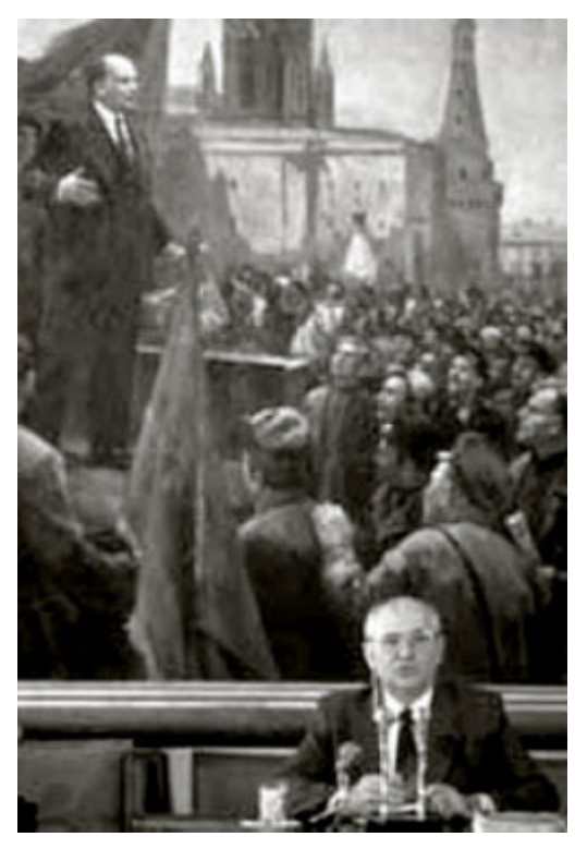
Figure 1 The end of the Soviet Union: Mikhail Gorbachev at a press conference, Moscow, July 1991 Long description