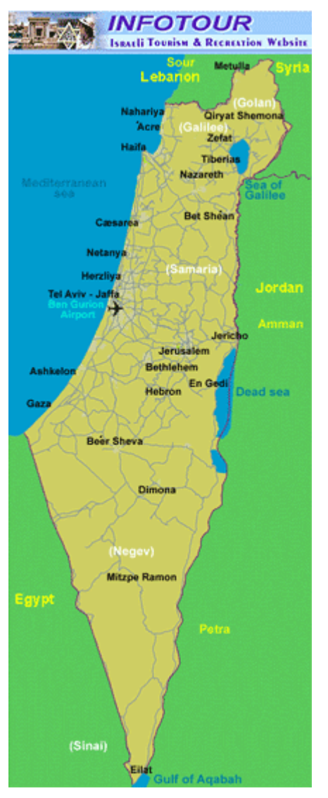
Figure 3 Visual images of a nation: website displaying map for Israeli tourism Long description