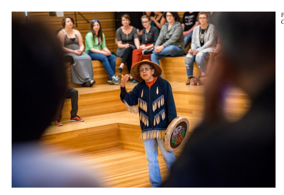
Fig 3.1: Indigenous Graduate Reception