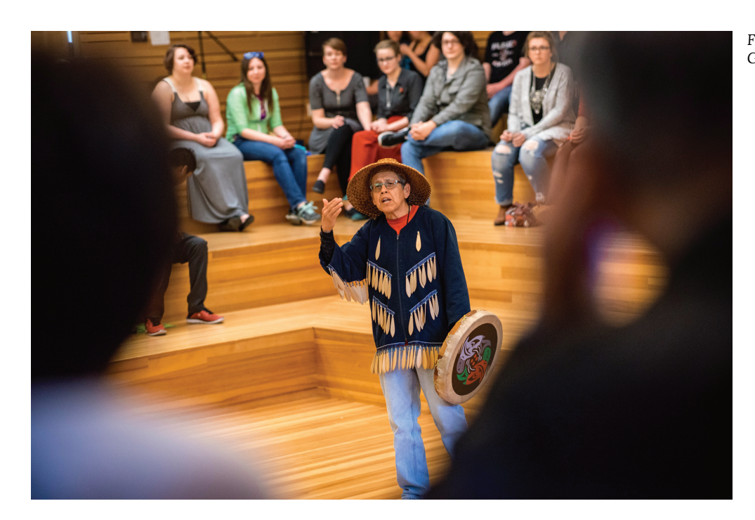
Fig 3.1: Indigenous Graduate Reception