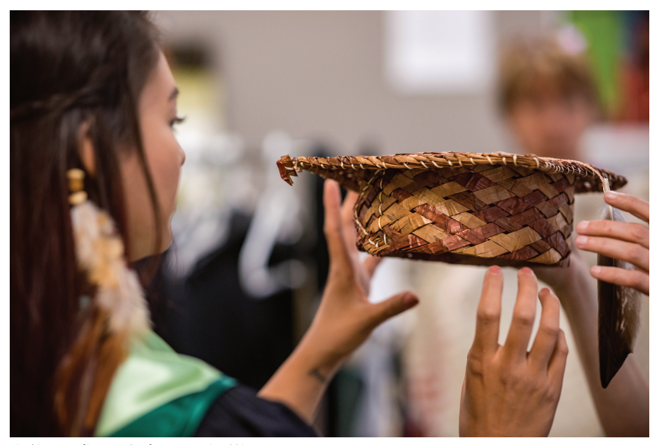
Fig 5.1: UFV Indigenous Graduate Reception 2017