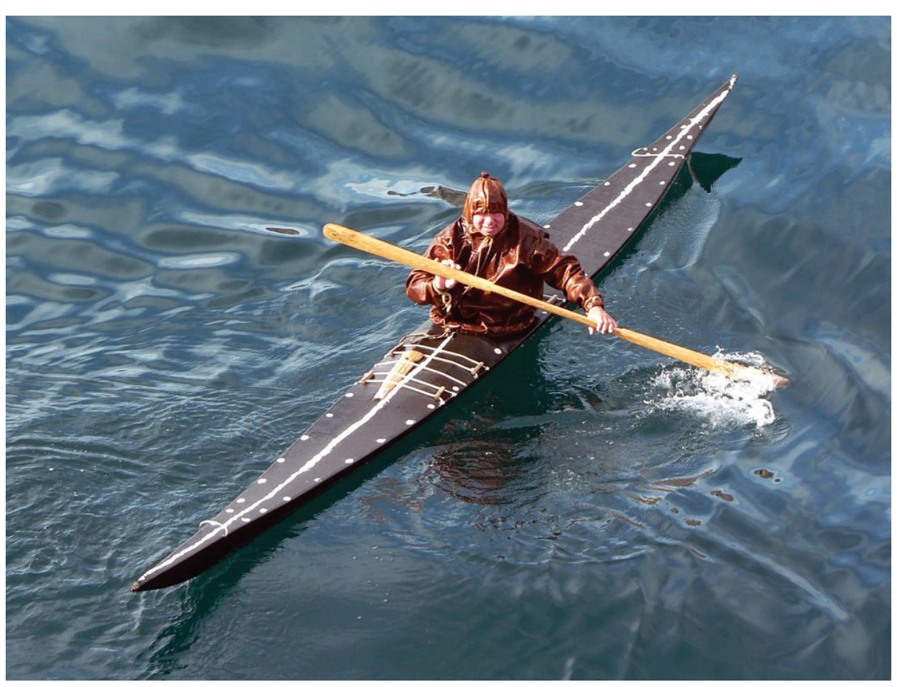
Fig 4.1: Inuit Kayaker