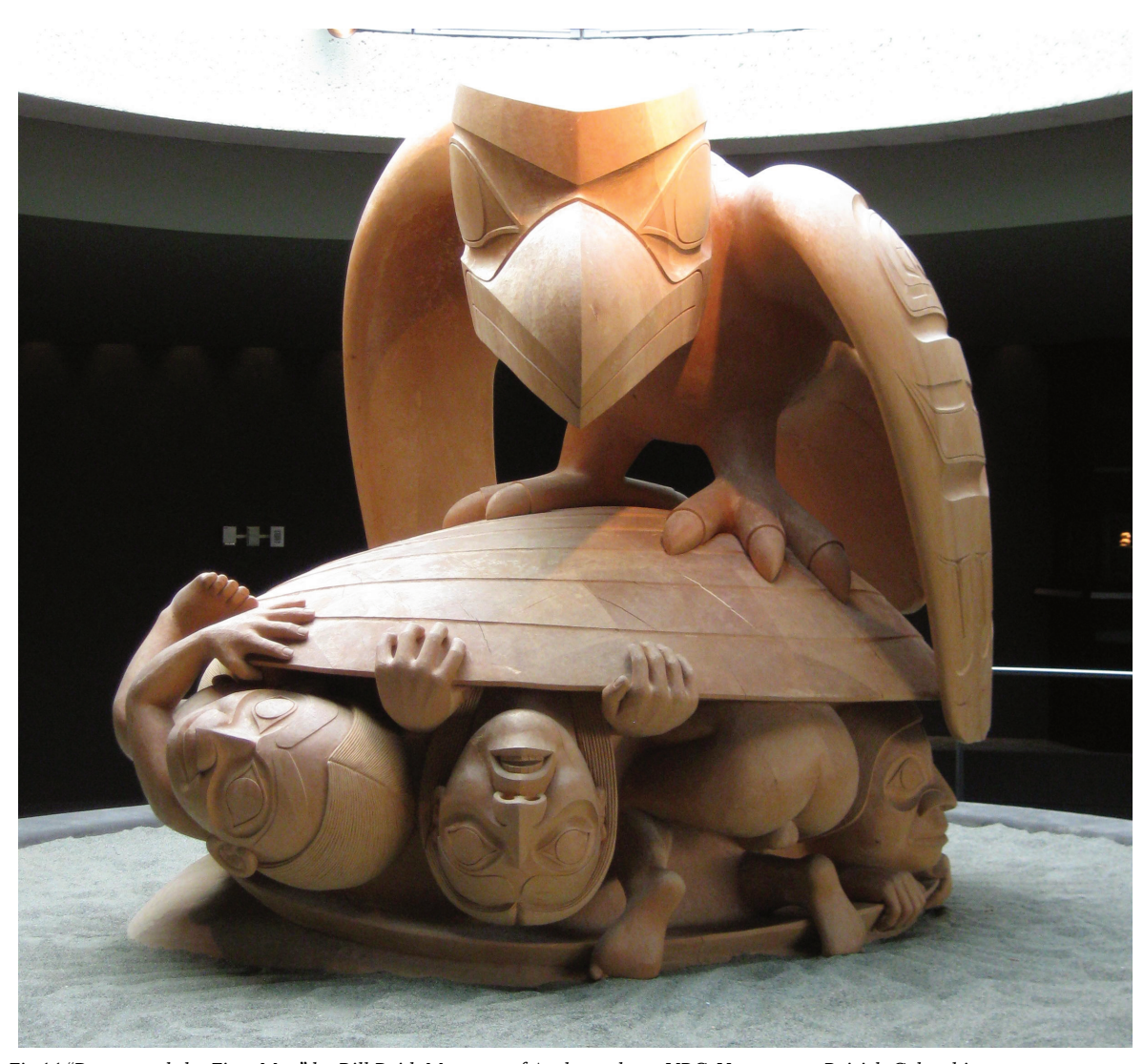
Fig 1.1 "Raven and the First Men" by Bill Reid, Museum of Anthropology, UBC, Vancouver, British Columbia