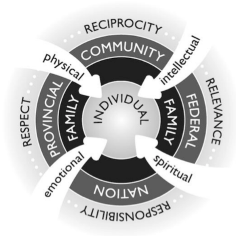
Fig 2.2: Indigenous wholistic framework.

This Indigenous wholistic framework provides guiding principles to ensure post-secondary institutions become accessible, inclusive, safe, and successful places for Indigenous students as follows: