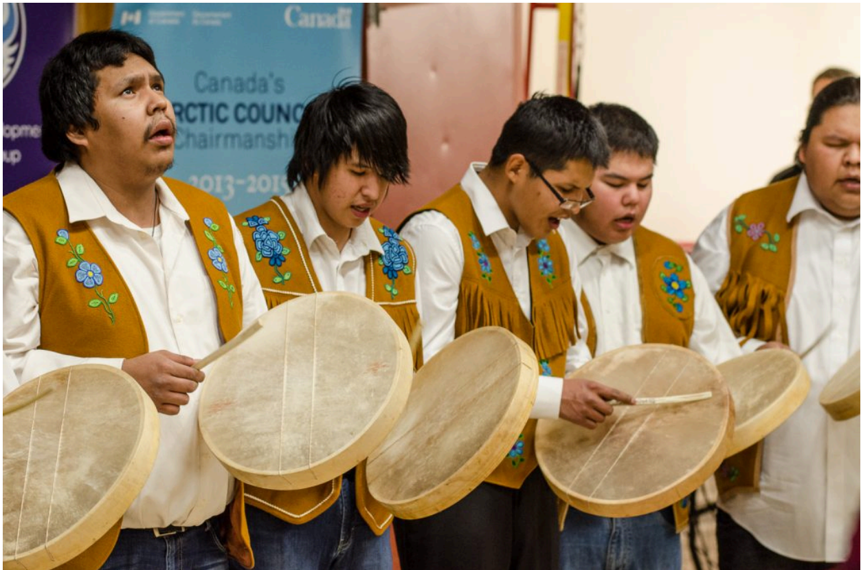
Fig 2.1: The Tlicho Drummers and the Yellowknives Dene First Nation Drummers.