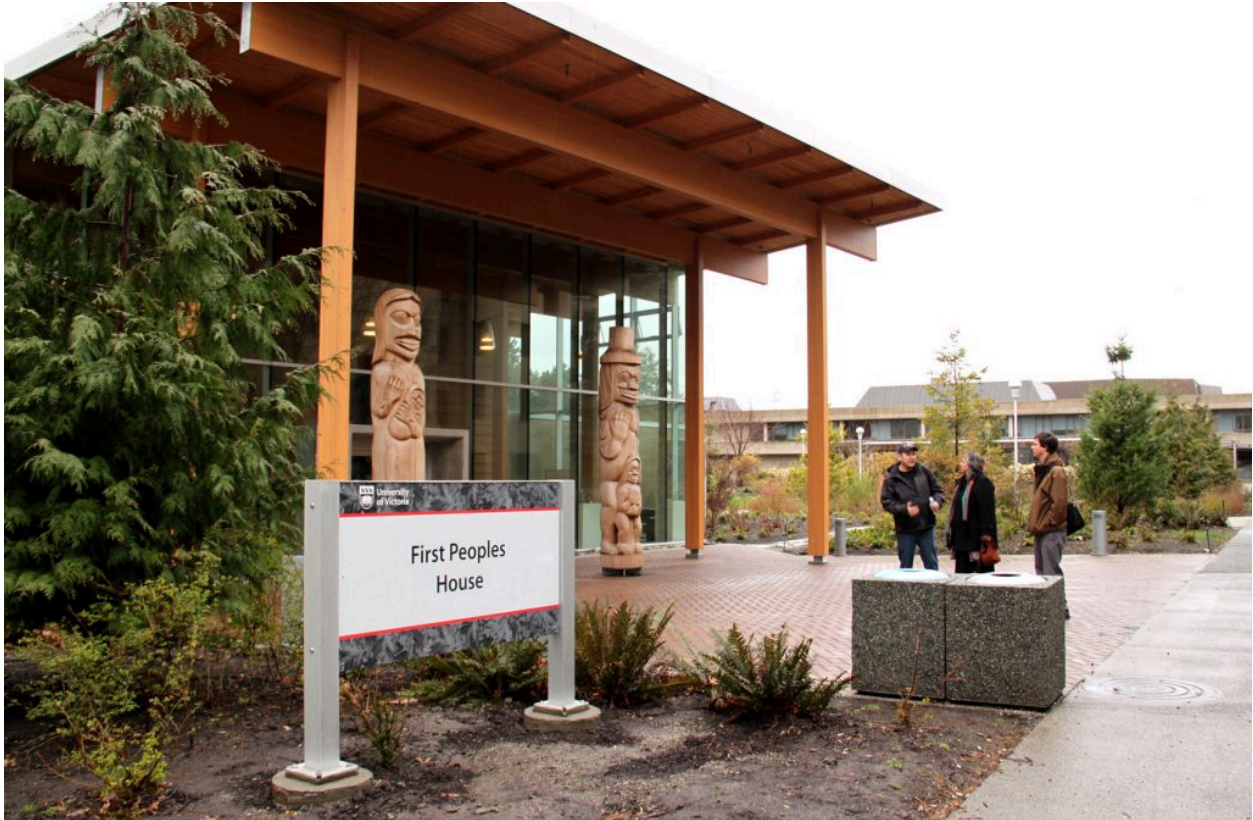
Fig 1.1: First Peoples House, University of Victoria.