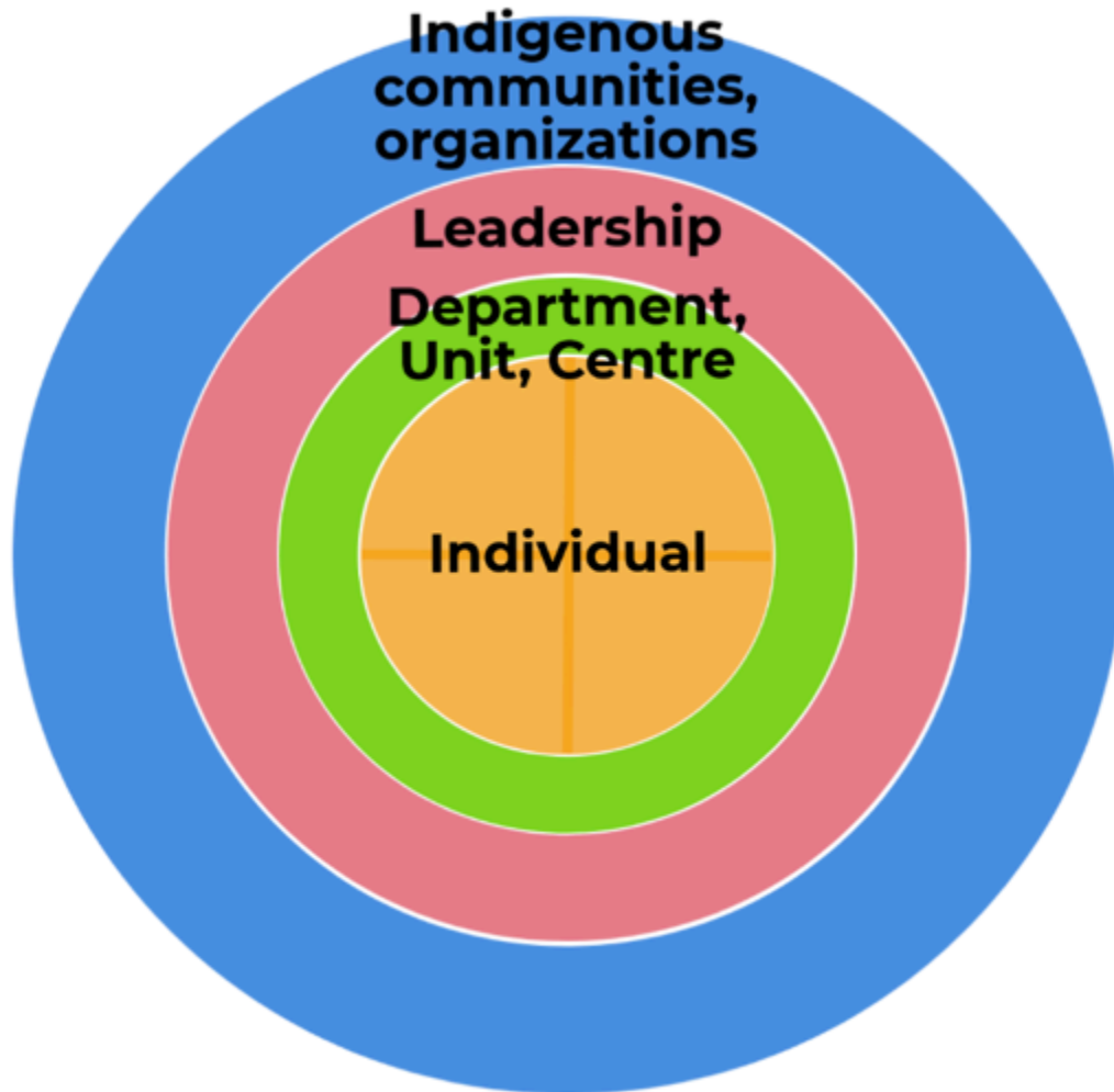
Fig 2.2: Institutional interconnections to Indigenization.

Indigenization in practice is deeply grounded in the traditions and cultural protocols of the traditional landholders that an institution is built upon; it is informed by the diversity of First Nations, Métis, and Inuit of Canada.