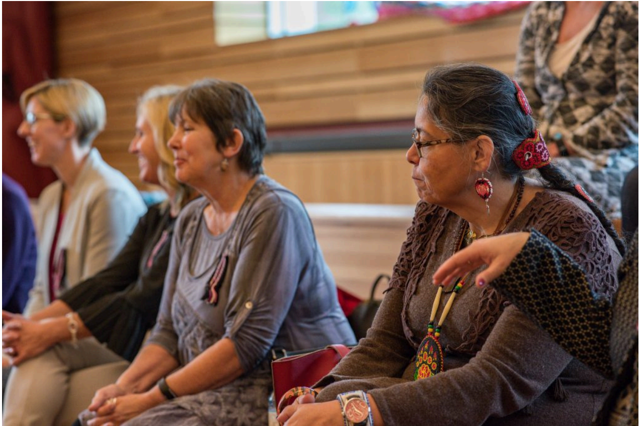
Fig 4.1: UFV – Metis Nation-BC Joint Project Announcement.