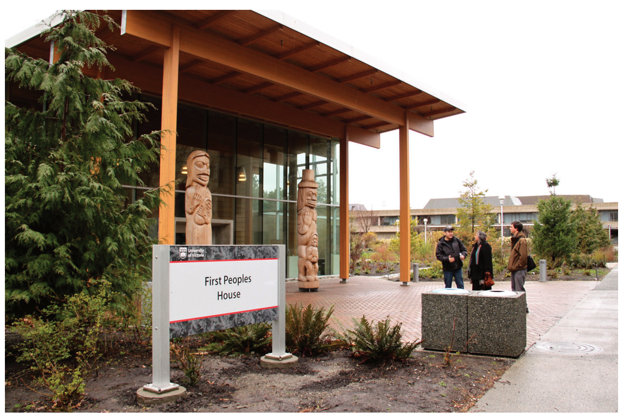
Fig 1.1: First Peoples House, University of Victoria.