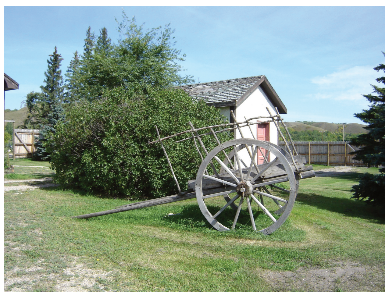
Fig 3.1: Red River Cart at RE-built fort at Fort Qu'Appelle Saskatchewan.