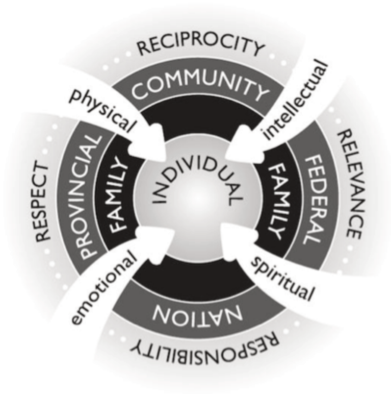
Fig 2.2: Indigenous wholistic framework.

This Indigenous wholistic framework provides guiding principles to ensure post-secondary institutions become accessible, inclusive, safe, and successful places for Indigenous students as follows: