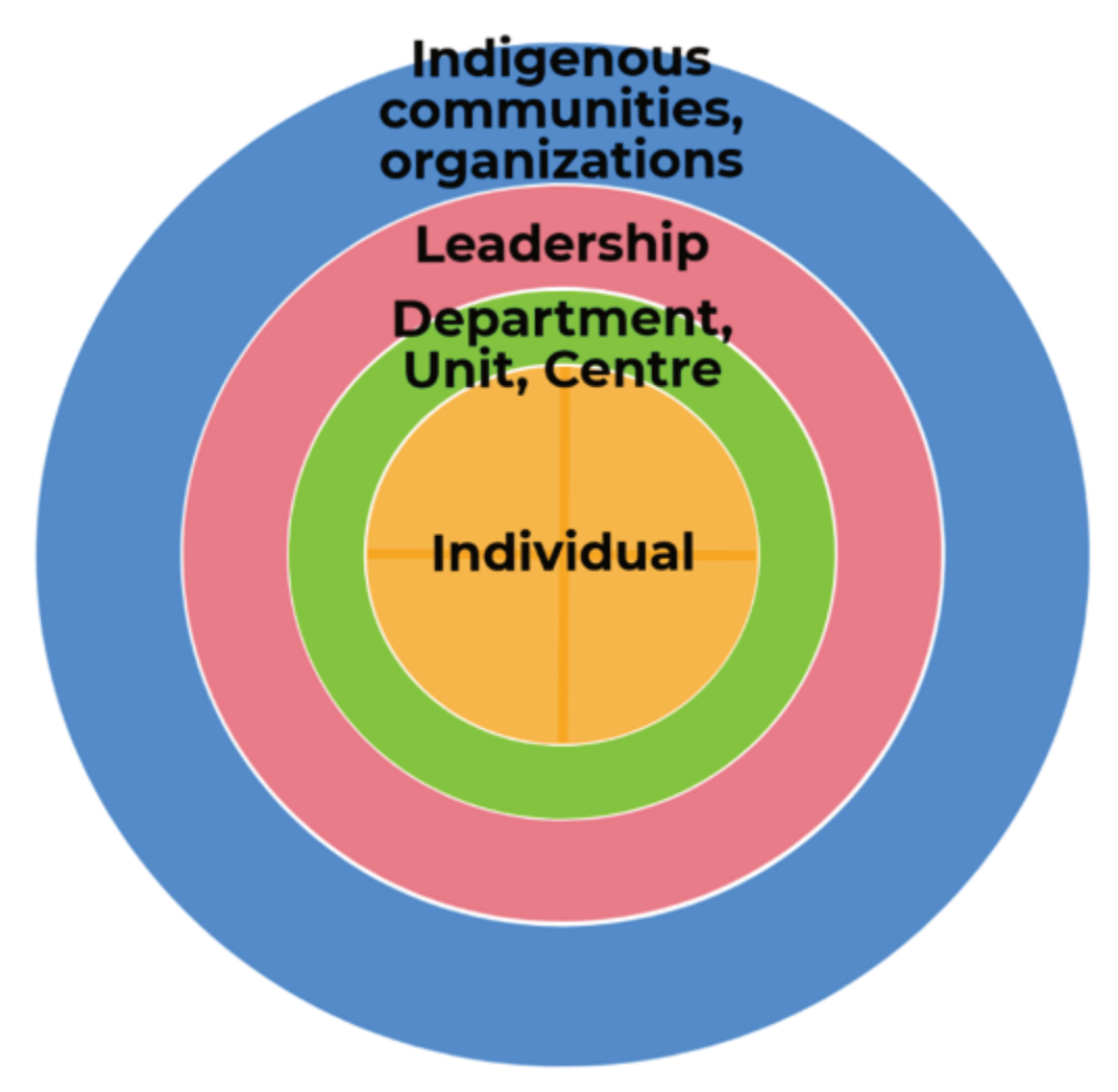
Fig 2.2: Institutional interconnections to Indigenization.

Indigenization in practice is deeply grounded in the traditions and cultural protocols of the traditional landholders that an institution is built upon; it is informed by the diversity of First Nations, Métis, and Inuit of Canada.