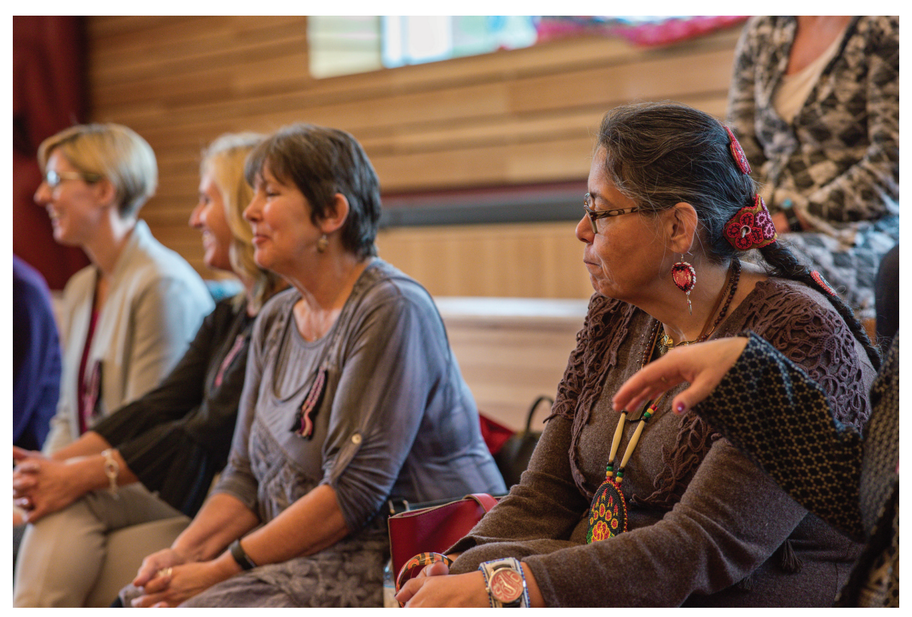
Fig 4.1: UFV – Metis Nation-BC Joint Project Announcement.