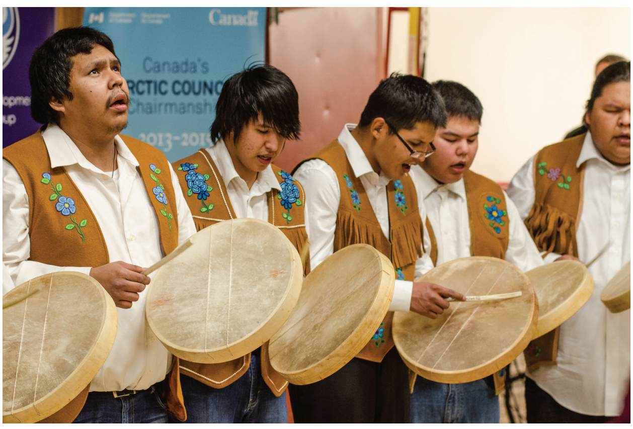
Fig 2.1: The Tlicho Drummers and the Yellowknives Dene First Nation Drummers.