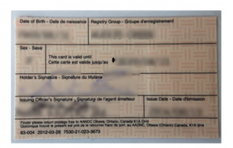
Fig 1.2: Status identity card.