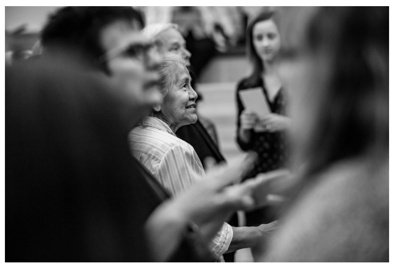
Fig 2.1: Indigenous graduate reception.