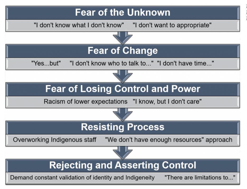
Fig 4.2: Levels of Indigenization. [Long Description]

If you are at a point of Indigenizing your practice, you may still have to face fears and concerns. When developing the framework for the Indigenization project, the project steering committee considered the statements and instances where systemic change is not supported. The committee members then situated them in "levels of Indigenization." These levels progress from fears to control and then rejection of Indigenization processes. They are not progressive levels, but they show that there are various levels of resistance and barriers to Indigenizing practice, field of study, and institutions.