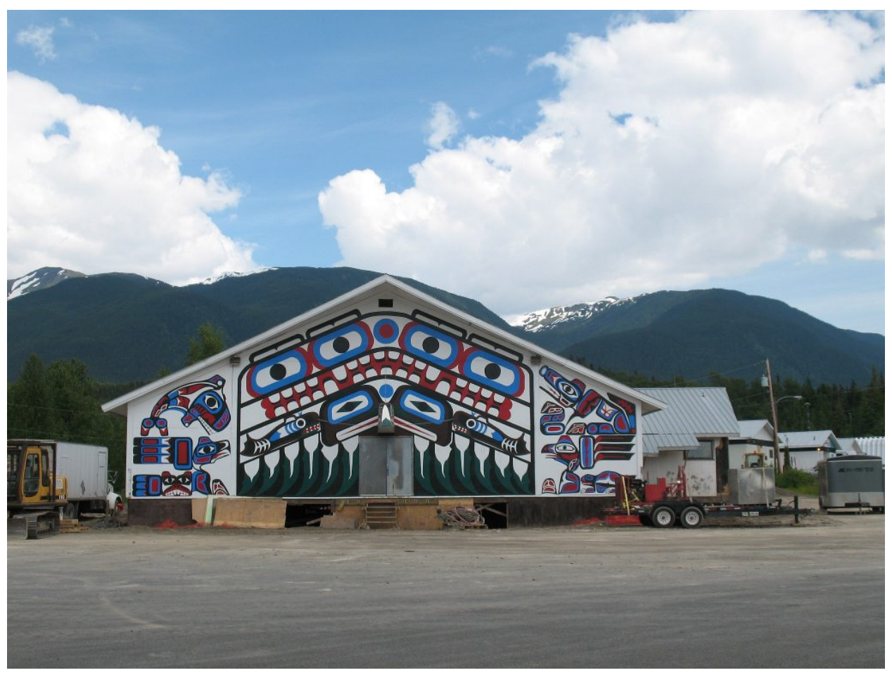
Fig 4.1: Traditional Nisga'a house in New Ayanish.