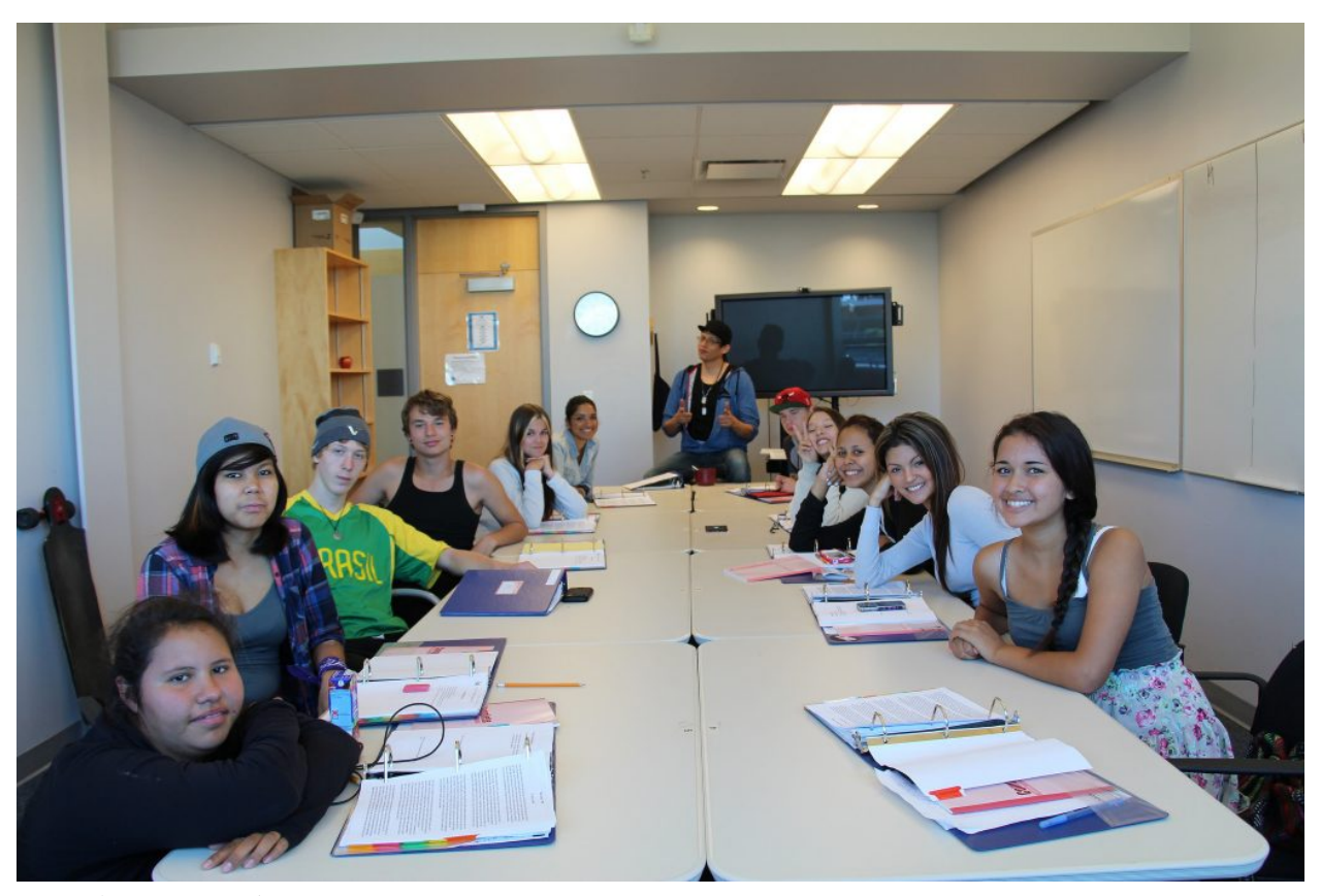
Fig 1.1: Aboriginal math/English camp.