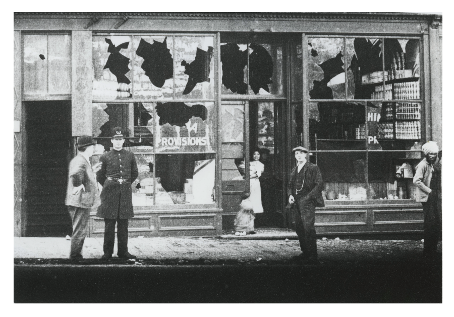
Building damaged during Vancouver riot of 1907 – 130 Powell Street. UBC Archives, JCPC_ 36 017.

On Saturday 7 September 1907, Vancouver was gripped by one of the largest race riots in Canadian history. This event started with a large gathering of people who also marched on City Hall, in that case behind a banner that said: "Stand for a White Canada." After listening to fiery speeches against Asian immigration, a significant number then headed to Chinese and Japanese neighbourhoods in the city, where they wreaked extensive property damage, physical violence, and terror.