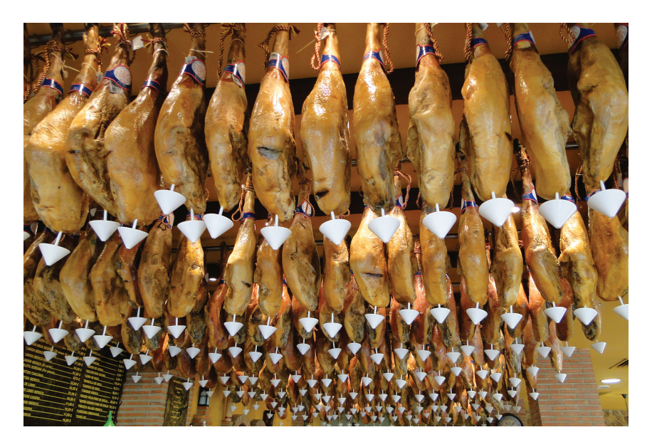
Ceiling display of Jamon Serrano and Jamon Iberico, Granada, Spain.