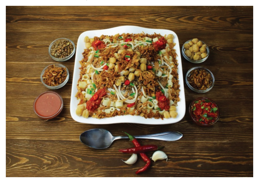
Kushari is made of rice, macaroni, and lentils mixed together, topped with tomato-vinegar sauce, garnished with chickpeas and crispy fried onions and sprinkled with garlic juice and hot sauce.

kitchens and mosque and church festivals. This dish, central to my own memories of 'home', remains confined to the familial private sphere and community cultural festivals.