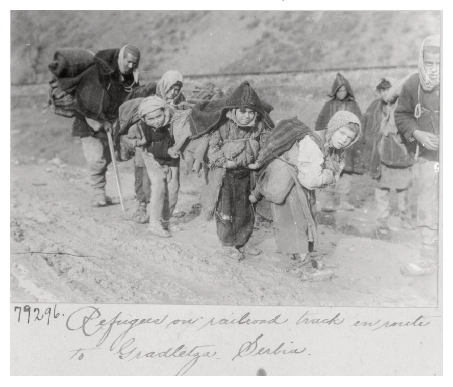
Image 1. "Refugees on railroad track en route to Gradletza, Serbia." Lewis Hine, 1919. (These handwritten captions are in Hine's own hand)

diately following the Great War. The ARC hired Hine because of his reputation as America's foremost photographer of social reform issues. Hine had trained as a sociologist and an educator. He was not a journalist, but rather a social reformer whose main medium of advocacy was the camera. By the mid-1910s, Hine had developed a reputation as "the most extensive and successful photographer of social welfare work in [America]." During the First World War, his positive portrayals of refugees served the ARC well in their development as America's foremost relief agency.