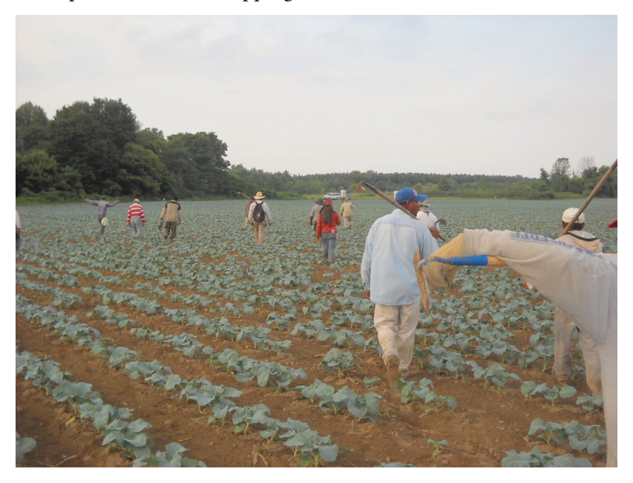
Returning to the vans at the end of the day, August 2010.

bunkhouse. The farmer had it timed so that we would depart exactly 45 minutes before sunrise, driving through the dark in order to arrive right as the sun's first light streamed across the field, allowing for maximum production during the daylight hours. Some days we would work until dark before returning to the bunkhouse. Workers often took advantage of the long drives to sneak in a few more minutes of sleep, sometimes leaving the driver as the only person awake in the van. Fortunately, he was not shy about blasting norteña music to keep himself awake, napping coworkers be damned.