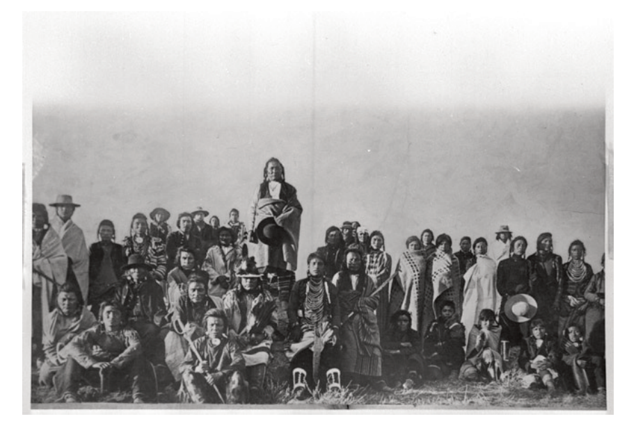
Little Bear's Band as they await deportation to Canada in 1896.

considered historically, are involved on both sides of the equation. The exodus of the Cree after the 1885 Rebellion offers a Canadian example. The Cree's experience serves not only as a reminder of our uncomfortable past, but also reveals some of the limitations in the model we continue to use to conceive of refugees and our obligations to them.