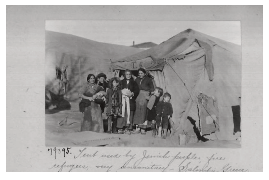
Image 2 "Tent used by Jewish people, fire refugees, very unsanitary. Salonika, Greece." 1919.