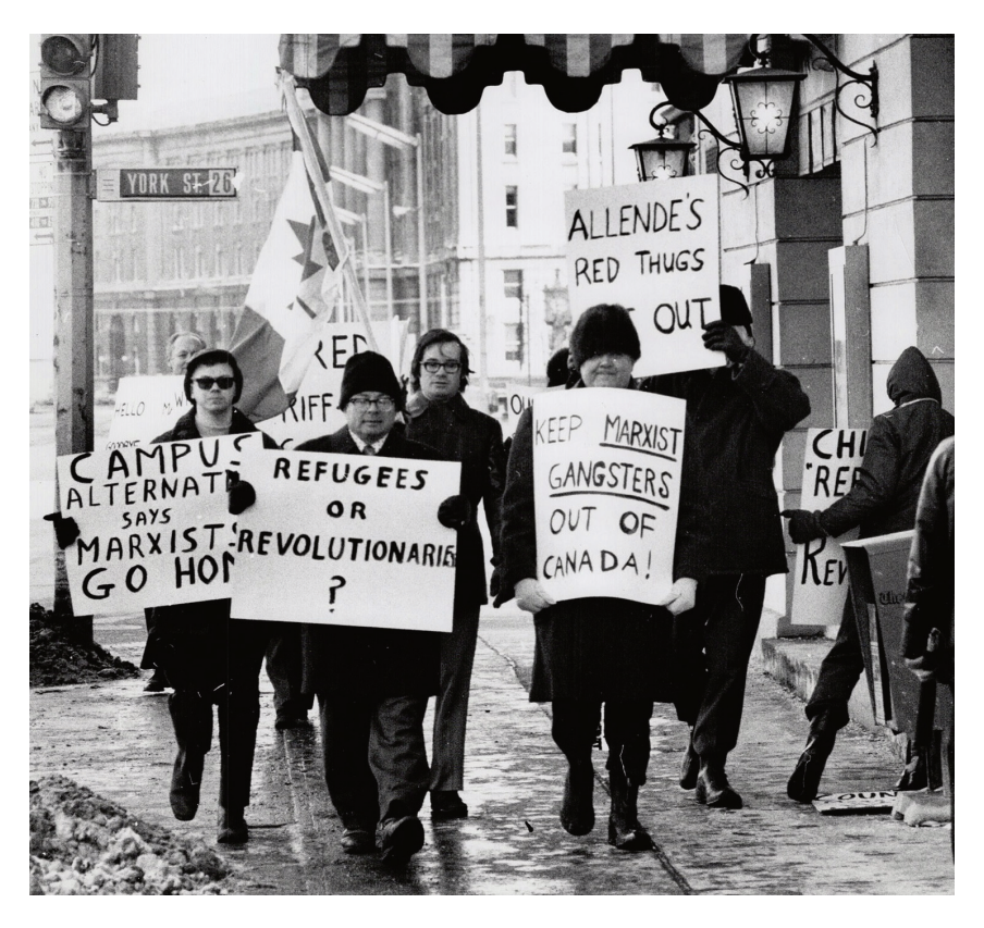
Protest against Chilean refugees, Toronto.

By mid-1979, nearly 1.5 million refugees had fled their homes in Southeast Asia. In June of 1979, the Canadian government announced that 60,000 Indochinese refugees would be resettled by the end of 1980. Thousands of Canadians came forward to welcome refugees, giving a dramatic launch to the new Private Sponsorship of Refugees Program. Popular pressure forced the government to adjust upwards its initial commitment to resettling the refugees. For the years 1978-81, refugees made up 25% of all immigrants to Canada.