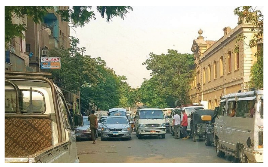
Typical traffic congestion in Cairo, as pedestrians, commuters, and standing traffic vie for space.

of the drivers accepted my claim that I was visiting Cairo from my hometown of Alexandria, where I was born and raised until my family chose to emigrate in my youth. I would then share that I was living in Toronto, Canada and was visiting to collect sources for my research. Every driver, without fail, would then relate how he had a friend or relative in a North American city and plans to emigrate.