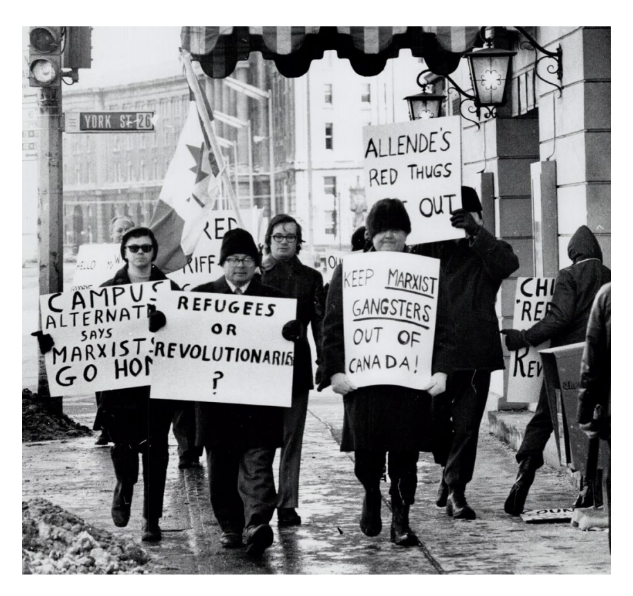
Protest against Chilean refugees, Toronto.

By mid-1979, nearly 1.5 million refugees had fled their homes in Southeast Asia. In June of 1979, the Canadian government announced that 60,000 Indochinese refugees would be resettled by the end of 1980. Thousands of Canadians came forward to welcome refugees, giving a dramatic launch to the new Private Sponsorship of Refugees Program. Popular pressure forced the government to adjust upwards its initial commitment to resettling the refugees. For the years 1978-81, refugees made up 25% of all immigrants to Canada.