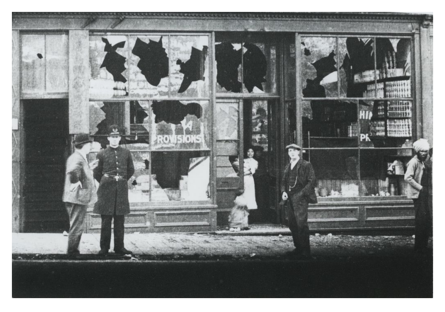
Building damaged during Vancouver riot of 1907 – 130 Powell Street.

On Saturday 7 September 1907, Vancouver was gripped by one of the largest race riots in Canadian history. This event started with a large gathering of people who also marched on City Hall, in that case behind a banner that said: "Stand for a White Canada." After listening to fiery speeches against Asian immigration, a significant number then headed to Chinese and Japanese neighbourhoods in the city, where they wreaked extensive property damage, physical violence, and terror.