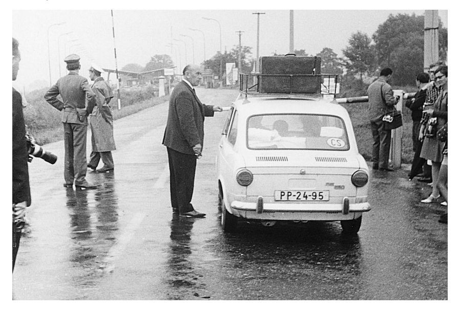
On the outskirts of Bratislava, a family prepares to cross the border into Berg, Austria (August 1968).

democratic values and refused to live under a totalitarian regime. Many resettled in the West in the hopes of liberating their homeland from communism. At the height of the Cold War, when Canadians were overly vigilant against the arrival of undesirable individuals from the Eastern Bloc, federal officials were keen to admit anticommunist Czechs and Slovaks who had fled from the events of 1948. These newcomers were often celebrated by the Canadian public as 'freedom fighters,' but also mistrusted as potential communist sympathizers or spies.