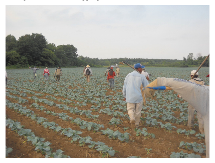
Returning to the vans at the end of the day, August 2010.

bunkhouse. The farmer had it timed so that we would depart exactly 45 minutes before sunrise, driving through the dark in order to arrive right as the sun's first light streamed across the field, allowing for maximum production during the daylight hours. Some days we would work until dark before returning to the bunkhouse. Workers often took advantage of the long drives to sneak in a few more minutes of sleep, sometimes leaving the driver as the only person awake in the van. Fortunately, he was not shy about blasting norteña music to keep himself awake, napping coworkers be damned.