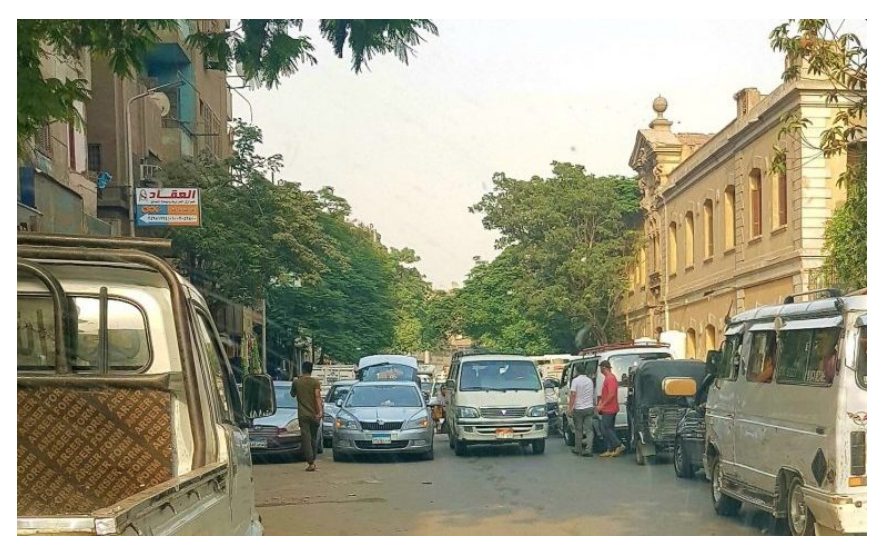
Typical traffic congestion in Cairo, as pedestrians, commuters, and standing traffic vie for space.

of the drivers accepted my claim that I was visiting Cairo from my hometown of Alexandria, where I was born and raised until my family chose to emigrate in my youth. I would then share that I was living in Toronto, Canada and was visiting to collect sources for my research. Every driver, without fail, would then relate how he had a friend or relative in a North American city and plans to emigrate.