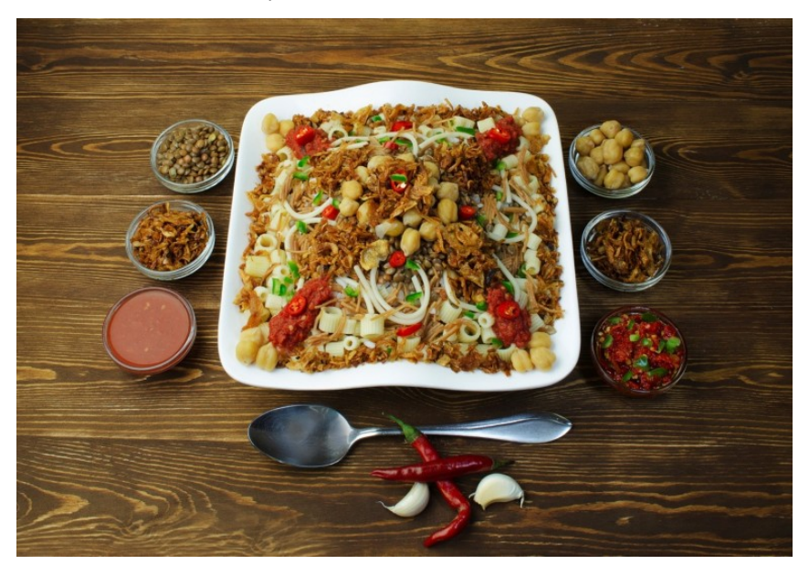
Kushari is made of rice, macaroni, and lentils mixed together, topped with tomato-vinegar sauce, garnished with chickpeas and crispy fried onions and sprinkled with garlic juice and hot sauce.

kitchens and mosque and church festivals. This dish, central to my own memories of 'home', remains confined to the familial private sphere and community cultural festivals.