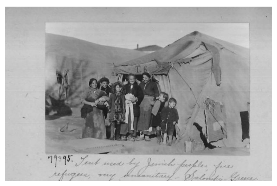
Image 2 "Tent used by Jewish people, fire refugees, very unsanitary. Salonika, Greece."