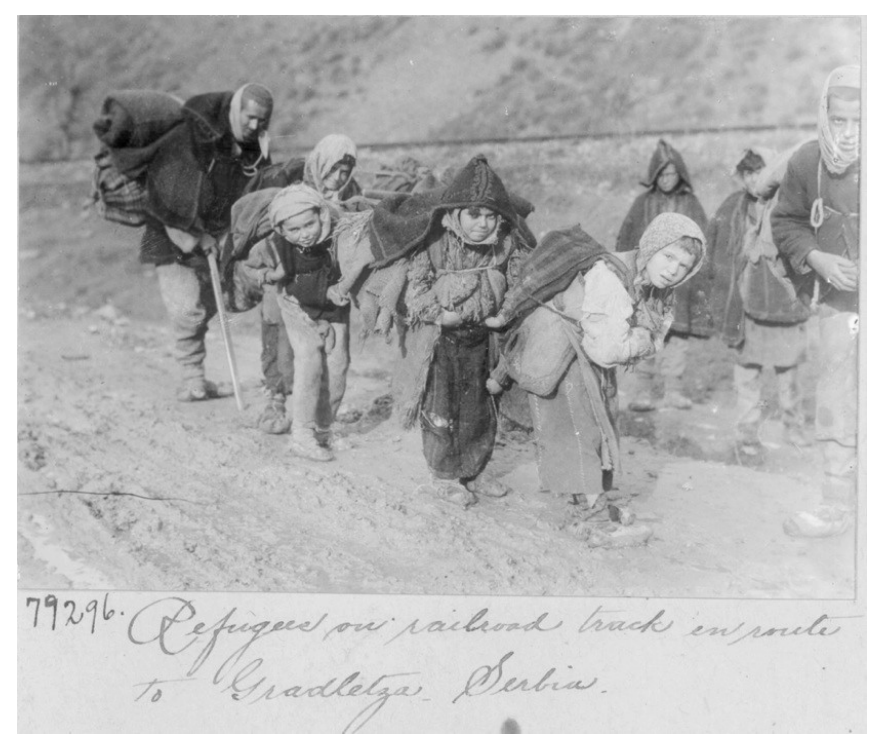
Image 1. "Refugees on railroad track en route to Gradletza, Serbia." Lewis Hine, 1919. (GCAH-79296). (These handwritten captions are in Hine's own hand)

diately following the Great War. The ARC hired Hine because of his reputation as America's foremost photographer of social reform issues. Hine had trained as a sociologist and an educator. He was not a journalist, but rather a social reformer whose main medium of advocacy was the camera. By the mid-1910s, Hine had developed a reputation as "the most extensive and successful photographer of social welfare work in [America]." During the First World War, his positive portrayals of refugees served the ARC well in their development as America's foremost relief agency .