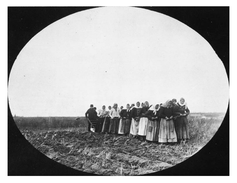
Doukhobor women, Thunder Hill Colony, Manitoba (ca. 1899).

that morally superior angel in the home. Consider too the distinctive dress of the women who completed the portrait of Immigration Minister Clifford Sifton's ideal Eastern European peasant "in a sheepskin coat" with "a stout wife and a half-dozen children" grudgingly welcomed to Canada. Someone needed to do the backbreaking labour to settle what was portrayed as an empty Prairie, the original First Nations inhabitants having been relegated to reserves. Even Icelandic pioneer women, easily assimilated, one might expect, into the Nordic race, were castigated for their typical headdress: a dark knitted skullcap with tassel. Such women may now be considered Old Stock Canadians, but not so long ago, their Anglo neighbours viewed them as second-class. According to historian Sarah Carter, Anglo women's organization in Alberta thought Ukrainian girls so deficient in the standards of proper womanhood that they too should be sent to residential schools.