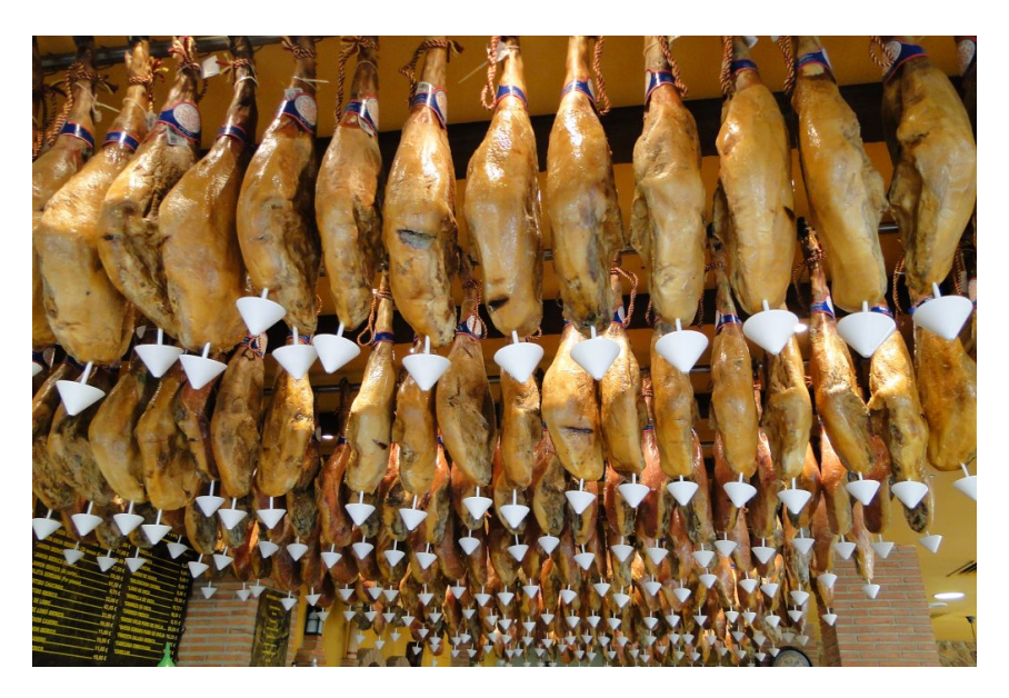
Ceiling display of Jamon Serrano and Jamon Iberico, Granada, Spain. Wikimedia Commons.