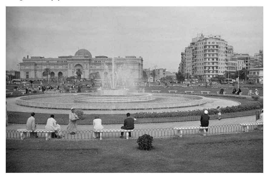
Cairo's Tahrir Square, mid-1900s.

the expectations of those wishing to emigrate have all changed in the past sixty years.