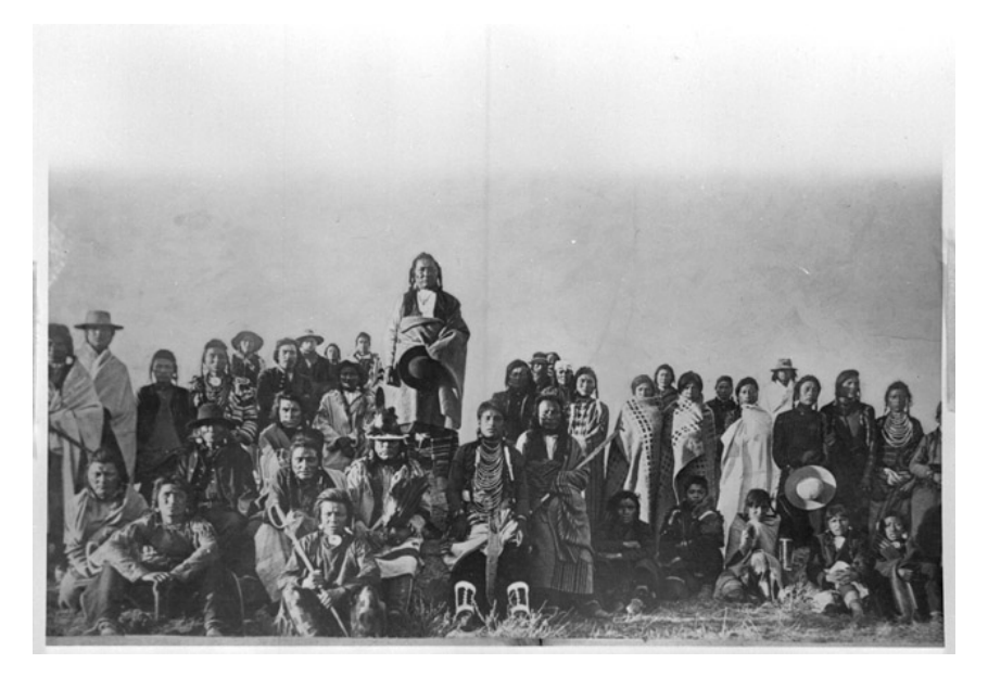
Little Bear's Band as they await deportation to Canada in 1896.

considered historically, are involved on both sides of the equation. The exodus of the Cree after the 1885 Rebellion offers a Canadian example. The Cree's experience serves not only as a reminder of our uncomfortable past, but also reveals some of the limitations in the model we continue to use to conceive of refugees and our obligations to them.