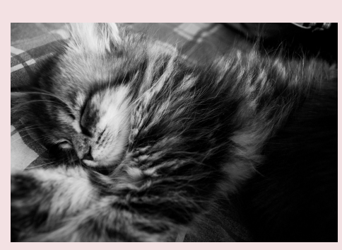
"Sleeping Kitten" by pedram navid is licensed under CC BY-NC-SA 2.0

You may be wondering about the difference between attribution and citation. One key difference is the purpose behind each; citation serves both academic and legal purposes whereas attribution satisfies a legal requirement. BCCampus has created a helpful guide to outline the nuances between attribution and citation.