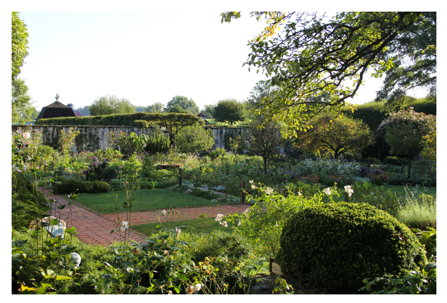
Fig. A2 Morning Garden. Oak Spring Garden Foundation, Upperville, Virginia.