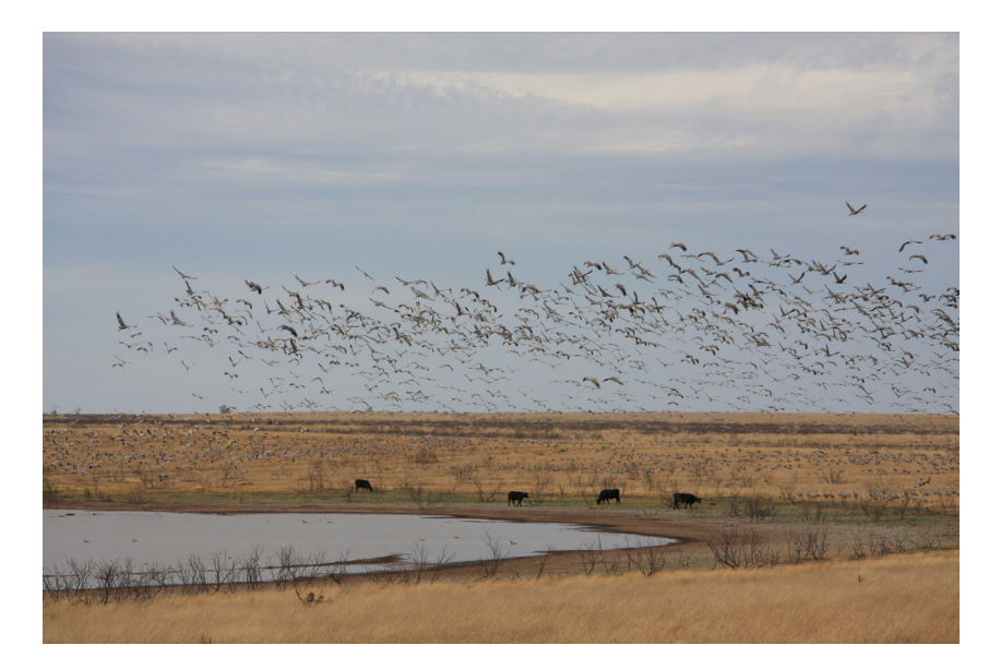
Fig. 2 Sandhill Crane in Flight, near Muleshoe National Wildlife Refuge, Baily Country, Texas.