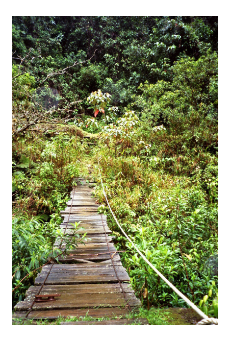
Fig. 4 Suspension Bridge in Cloud Forest Near Mindo, Ecuador.