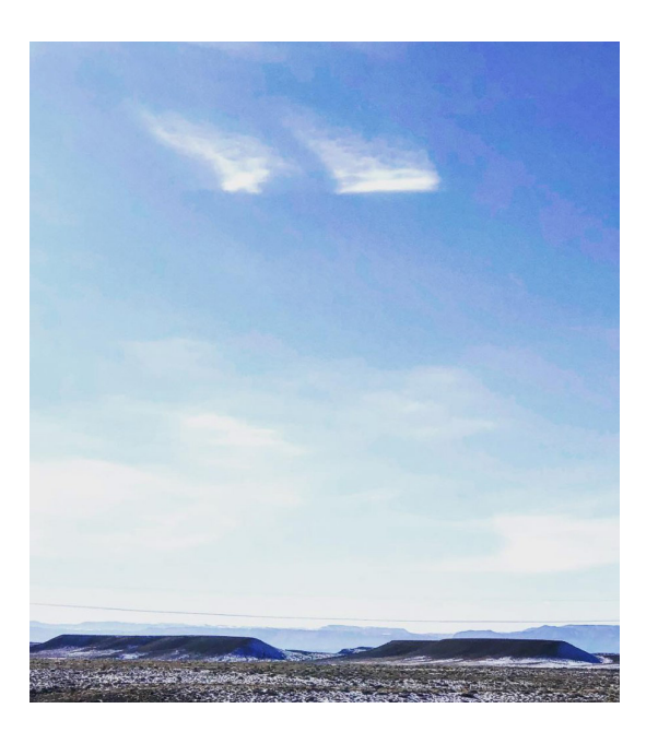
Fig. 7 Unnamed Buttes South of Wellington, Utah.

before falling into the perfect hole. The sound the ball makes as it drops into the hole — that is what I mean by 'register' or 'resonate').