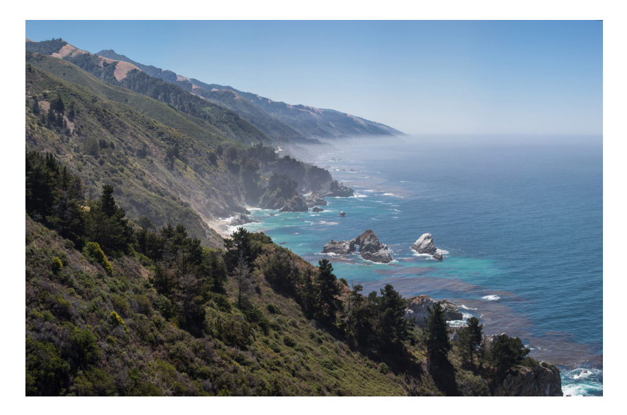
Fig. 6 Central Californian Coastline, Big Sur.