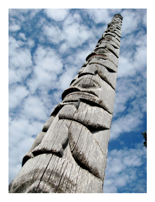
Fig. 8 Totemic Sentry, Prince Rupert, British Columbia, Canada.