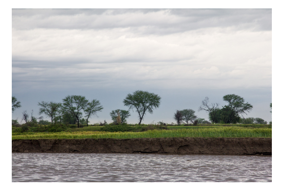
Fig. 5 Yamuna River, near the Himalayas.