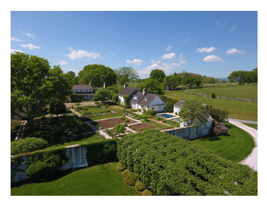
Fig. A1 Garden Aerial. Oak Springs Garden Foundation House, Upperville, Virgina.