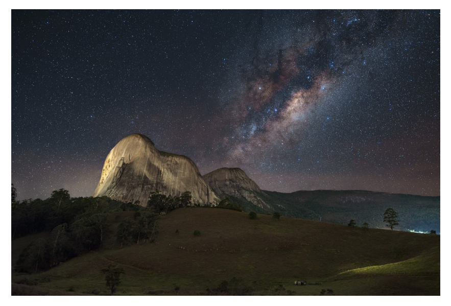
Fig. 9 Pedra Azul Milky Way.