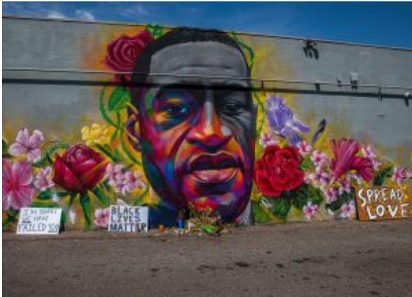
A painting of George Floyd's face surrounded by array of colourful painted flowers on outdoor wall.

In 2020, the world was shaken by the brutal murder of George Floyd at the hands of a police officer in Minneapolis, Minnesota. This served as a catalyst for the Black Lives Matter movement to expand globally. Protests erupted worldwide in solidarity for George Floyd and the countless other Black people murdered by those sworn to serve and protect. People began to understand what Black people and other visible minorities had been saying for years about racism being both blatantly present and deeply interwoven into our social structures.