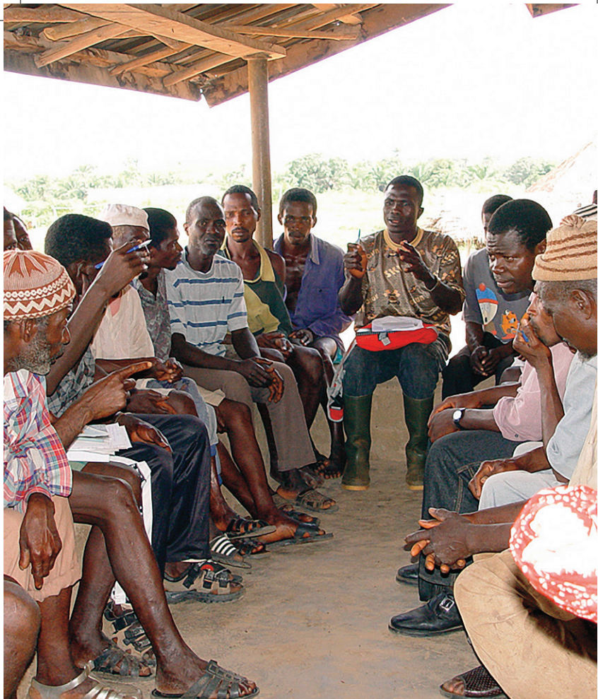
Democracy needs both conflict and consensus. In this photo, men in Sierra Leone discuss law.