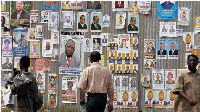
Free choice is essential in elections. Here, voters in the Democratic Republic of Congo peruse choices in 2006.

access to the ballot is not enough. The party in power may enjoy the advantages of incumbency, but the rules and conduct of the election contest must be fair. On the other hand, freedom of assembly for opposition parties does not imply mob rule or violence. It means debate.