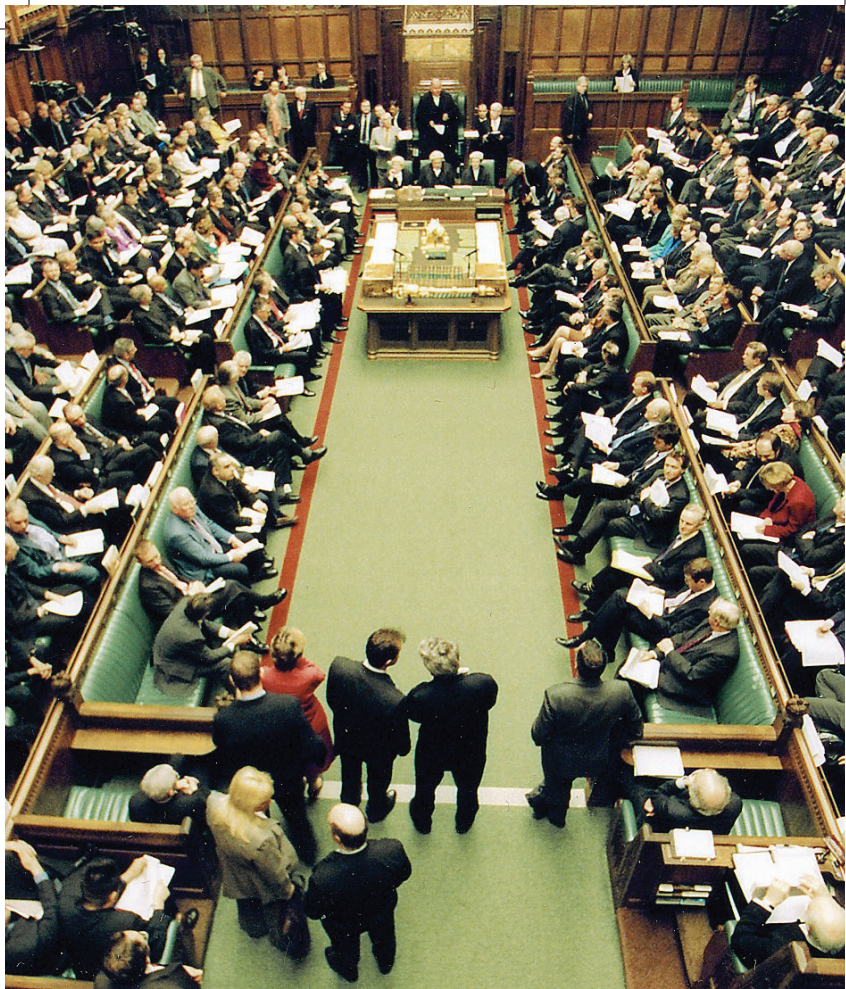
England's House of Commons, the lower chamber of the British Parliament, is one of the world's oldest and most successful democratic institutions.