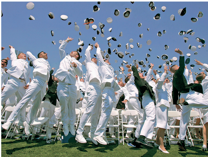
U.S. military cadets throw their hats in the air upon graduation. A professional military needs to be as well educated as its civilian overlords.

because they are the people's representatives and, as such, are charged with the responsibility for making these decisions and remaining accountable for them.