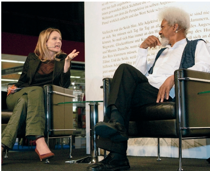
Public discussion on all kinds of topics—personal, cultural, political—is the lifeblood of democracy. Above: Nigerian Nobel Prize winner Wole Soyinka at a Swiss book fair.

private organizations, some local, some national. Many of them serve a mediating role between individuals and society's complex social and governmental institutions, filling roles not given to the government and offering individuals opportunities to become part of their society without being in government.