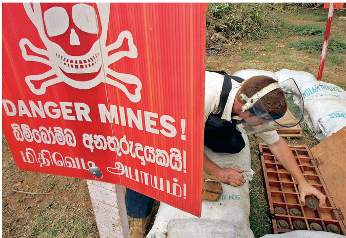
A field worker for a British NGO removes and stores a land mine in Sri Lanka.

Governments and NGOs frequently work as partners. NGOs may provide expertise and personnel on the ground for implementation of government-funded projects. NGOs may be politically unaffiliated, or they may be based on partisan ideals and seek to advance a particular cause or set of causes in the public interest. In either model the key point is that NGOs operate under minimal political control of states.