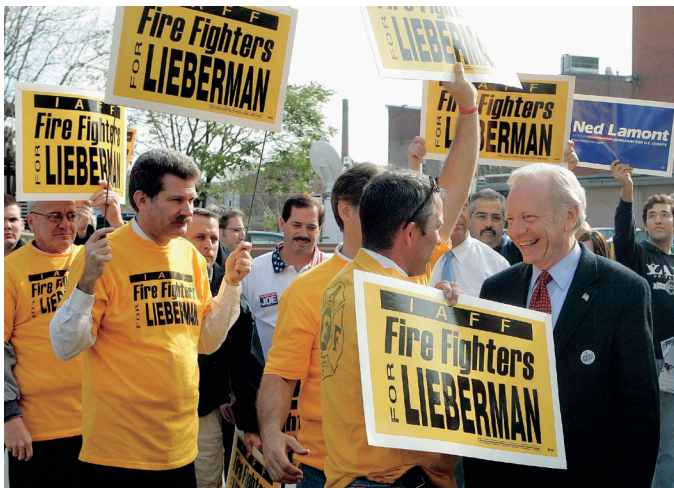
Connecticut senatorial candidate Joseph Lieberman courts firefighters in 2006. Interest groups are wooed and won by politicians one at a time.

organizations functioning largely in Congress and at the state level—which then coalesce into active national organizations every four years to mount presidential election campaigns. Election campaigns in a democracy are often elaborate, time-consuming, and sometimes silly. But their function is serious: to provide a peaceful and fair method by which the people can select their leaders and determine public policy.