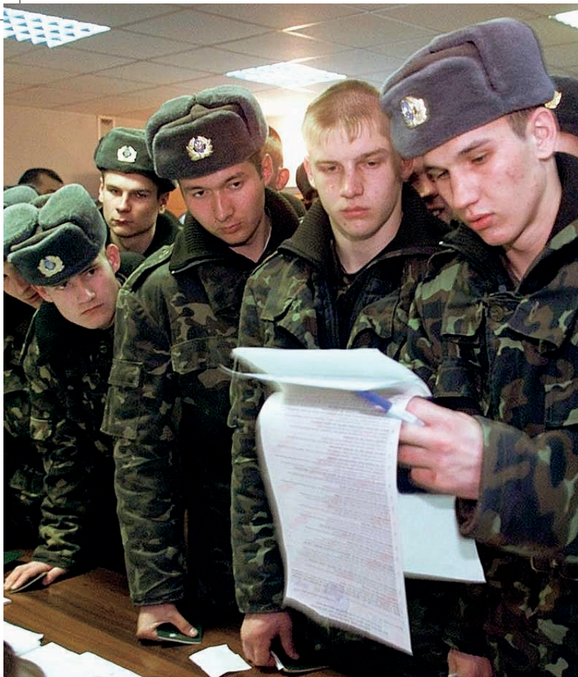
Ukrainian soldiers examine ballots in Kiev in 2002.