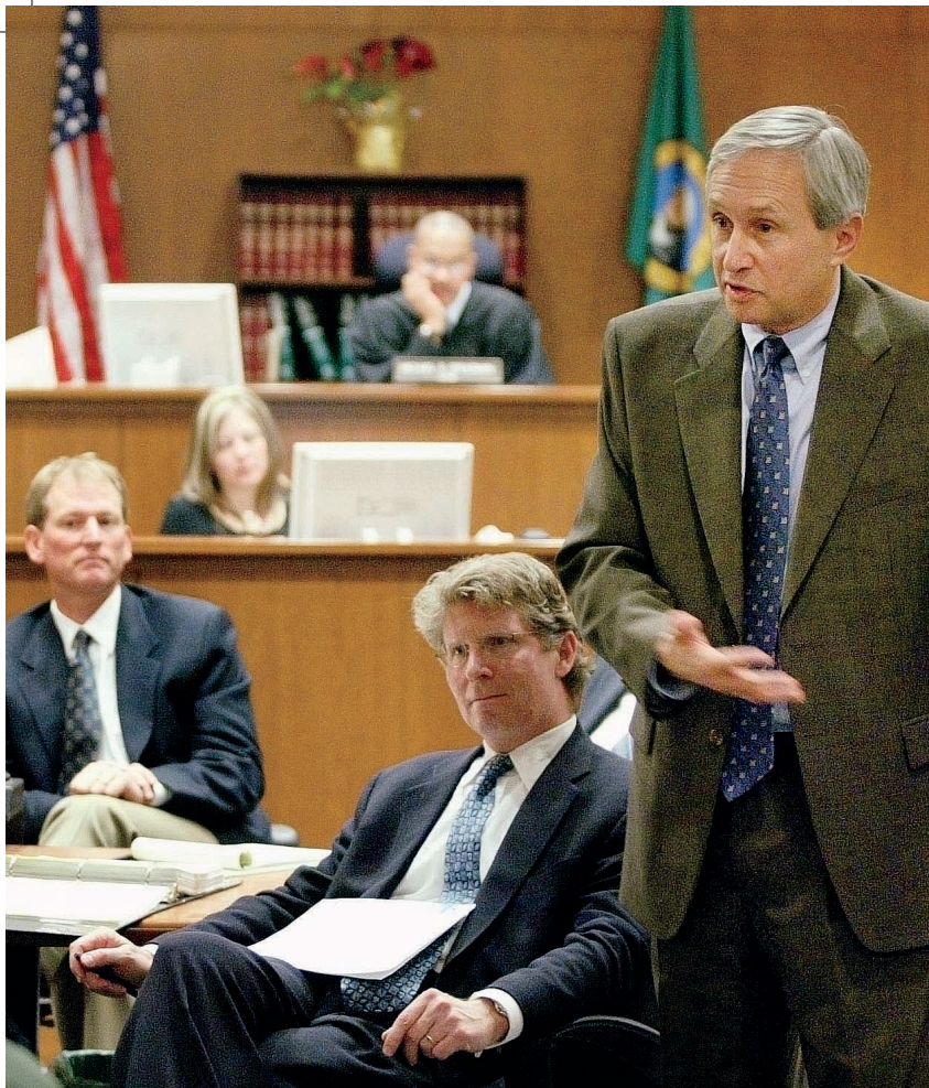
Rule of law can be complicated: above, a lawsuit alleging wrongful employment termination begins in court in the State of Washington, 2005.