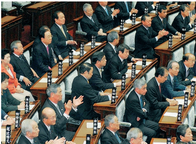
In democracy, losers and winners wage political warfare via parliamentary procedure. Above: Japanese parliament, Tokyo.