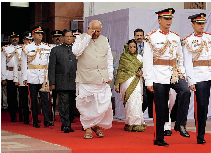
Some democracies combine elements of presidential and parliamentary systems: above, Indian President Pratibha Patil arrives at her swearing-in ceremony, 2007.

In a presidential system, by contrast, the president is usually elected separately from the members of the legislature. Both the president and the legislature have their own power bases and political constituencies, which serve to check and balance each other.