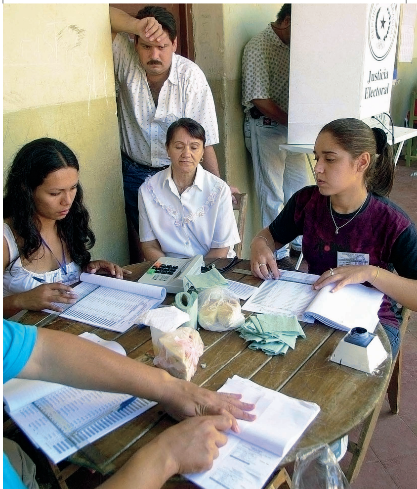
Fair, frequent, and well-managed elections are essential in a democracy. Here, election officials staff a voting station in Paraguay.