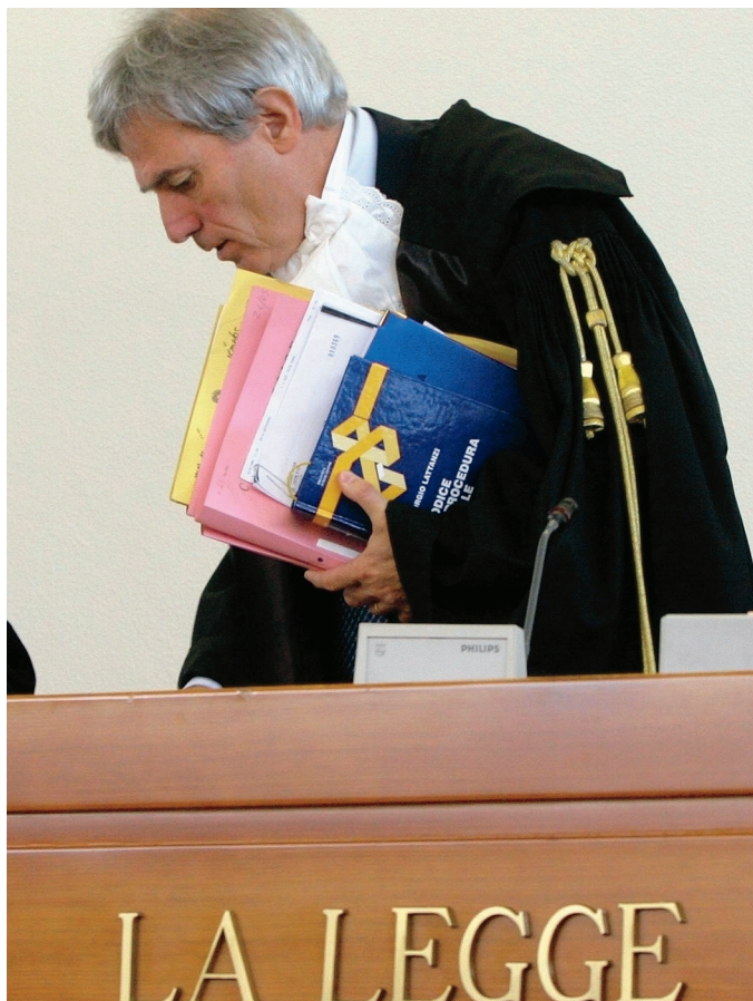
A judge leaves his bench during a criminal trial in Rome, 2005. The judge's costume reflects centuries of legal tradition.