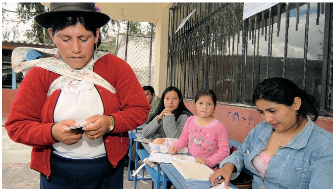
Citizens vote on laws and issues as well as candidates for office. This 2007 photo shows an Ecuadorian woman voting on constitutional reform.

Popularly elected representatives hold the reins of power; they are not simply figureheads or symbolic leaders.