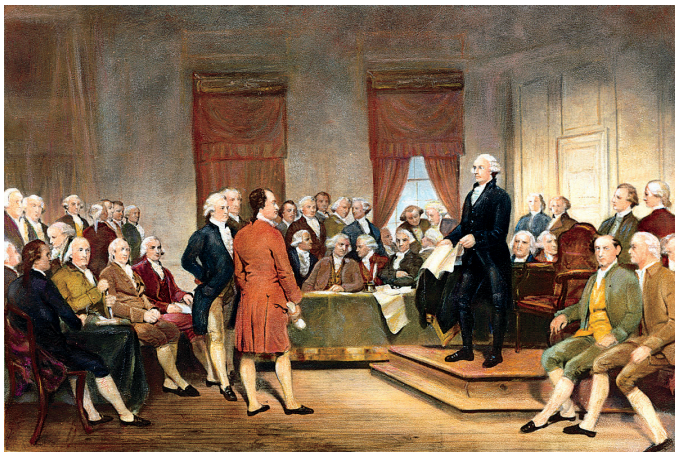
Signing of the U.S. Constitution, Philadelphia, 1787.

well as 18th-century philosophers' attempts to define the rights of man.