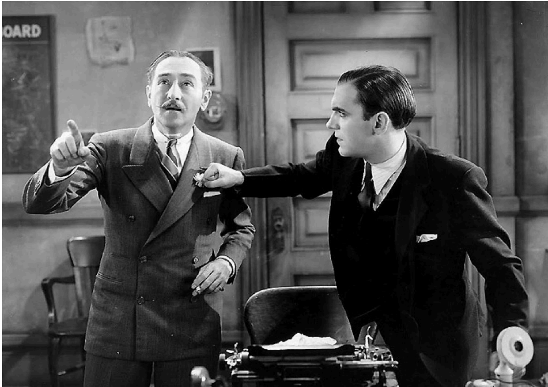
In this scene from the movie, The Front Page , the key light and fill light are high in this shot with Adolph Menjou and Pat O'Brien, which is often the case with comedies.