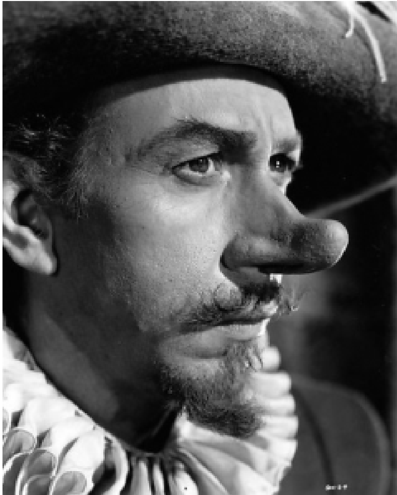
Regarding a character's physiology, the most important and influential part of the movie, Cyrano de Bergerac , is based on Cyrano's nose.

of expressing his love for Roxane near the beginning of the movie, he lives vicariously through Christian.