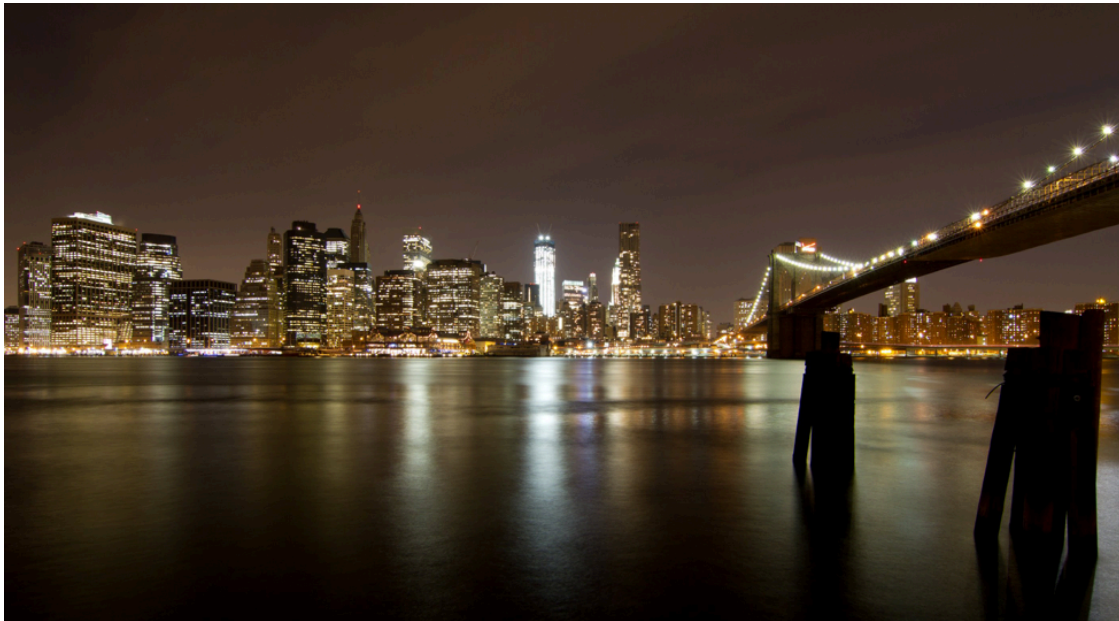
A wide shot or long shot is used when a group of people are being filmed, as in an action scene.

An extreme wide shot, as indicated below, is used at the beginning of a scene when the director wants to identify where the scene is taking place. The establishing shot is a photo of a location that the viewer is familiar with, so immediate recognition of the setting for the scene by the viewer is accomplished.