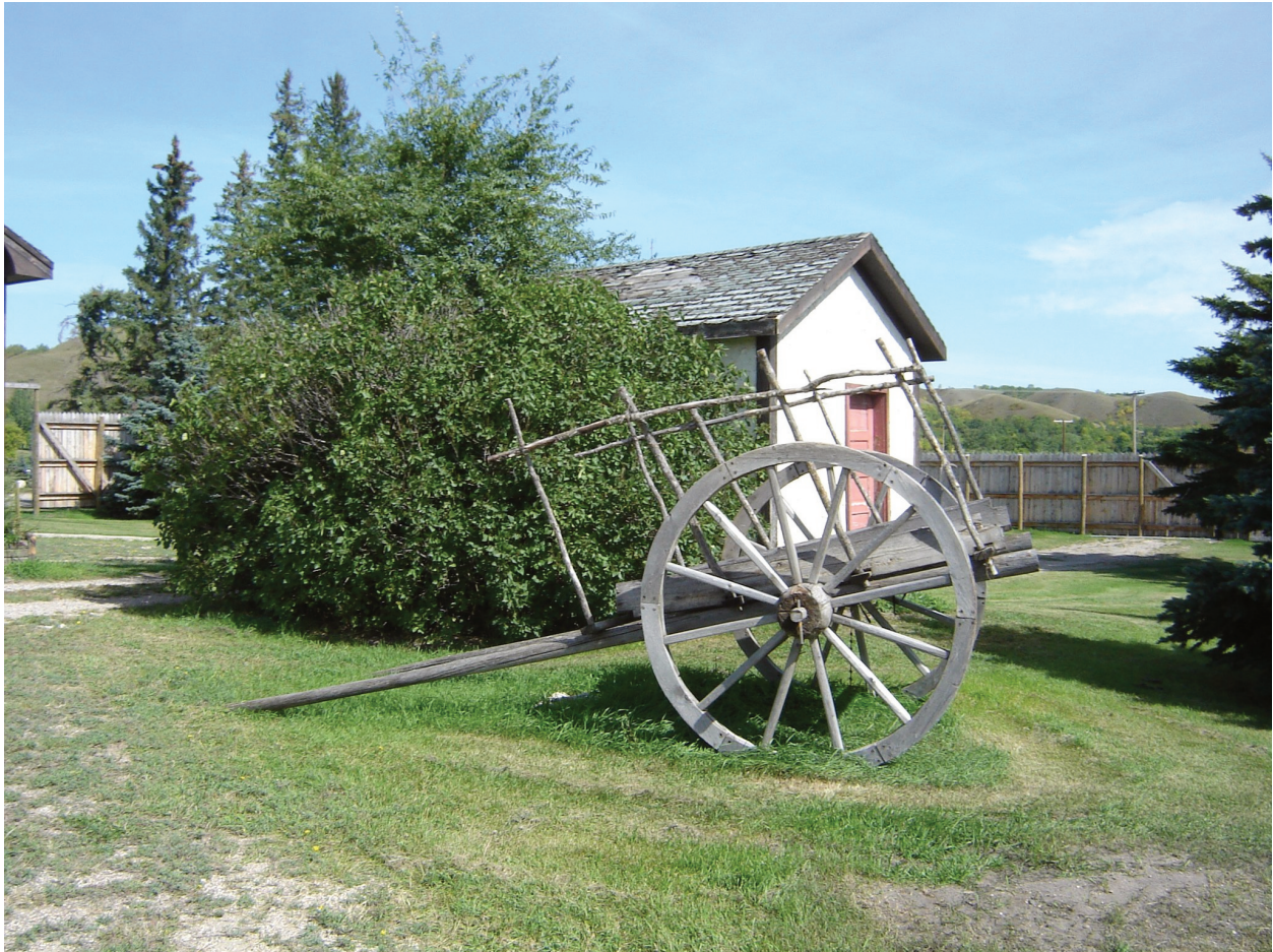
Fig 3.1: Red River Cart at RE-built fort at Fort Qu'Appelle Saskatchewan.