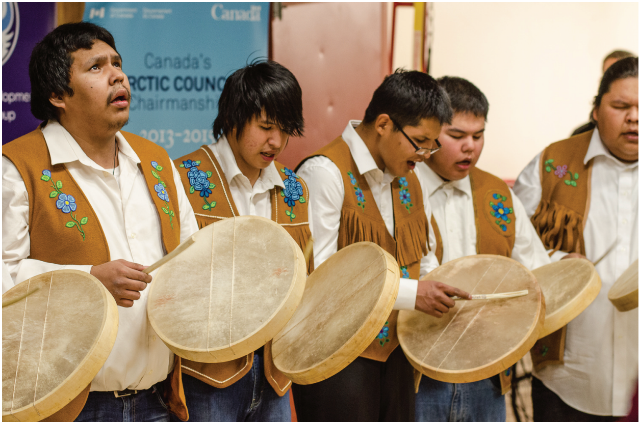
Fig 2.1: The Tlicho Drummers and the Yellowknives Dene First Nation Drummers.