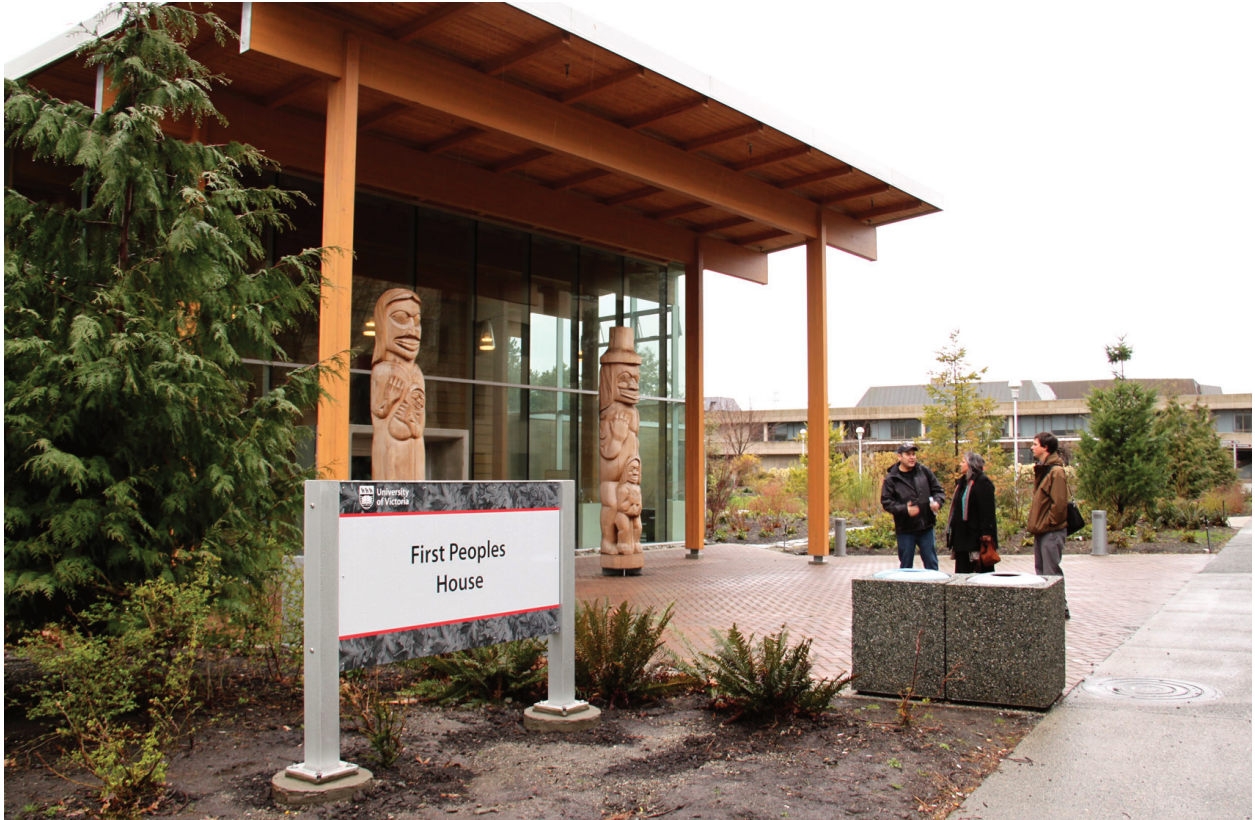
Fig 1.1: First Peoples House, University of Victoria.