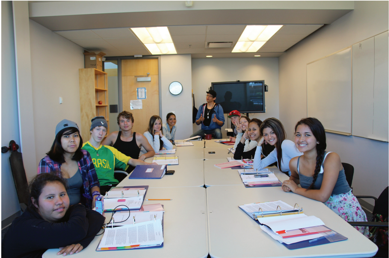
Fig 1.1: Aboriginal math/English camp.