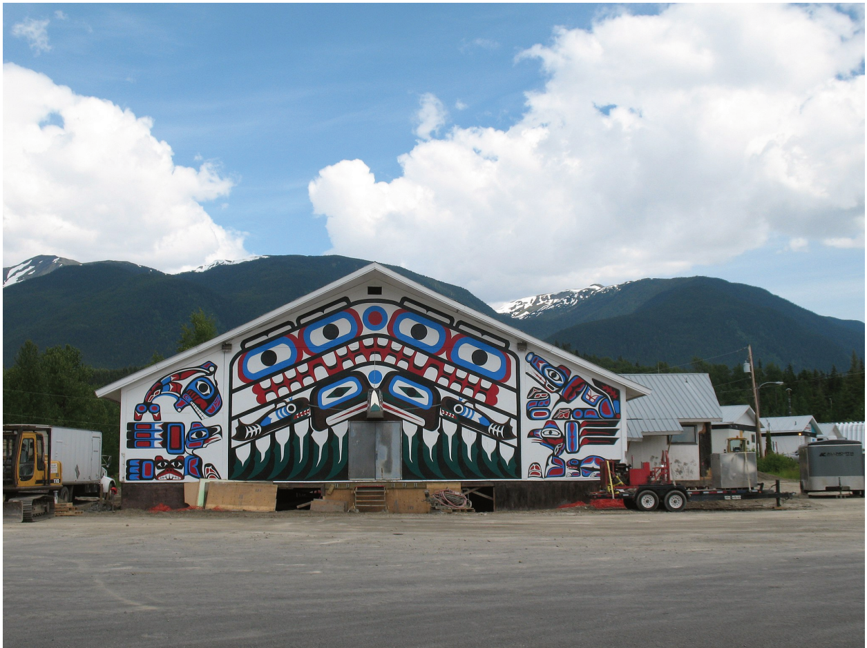
Fig 4.1: Traditional Nisga'a house in New Ayanish.