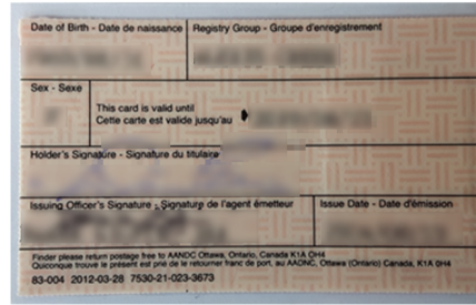
Fig 1.2: Status identity card.