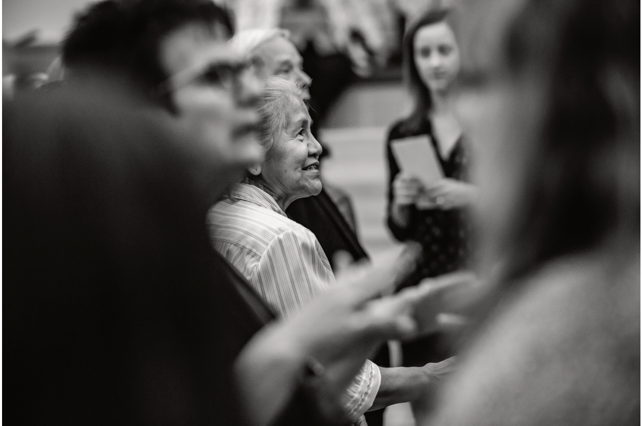
Fig 2.1: Indigenous graduate reception.