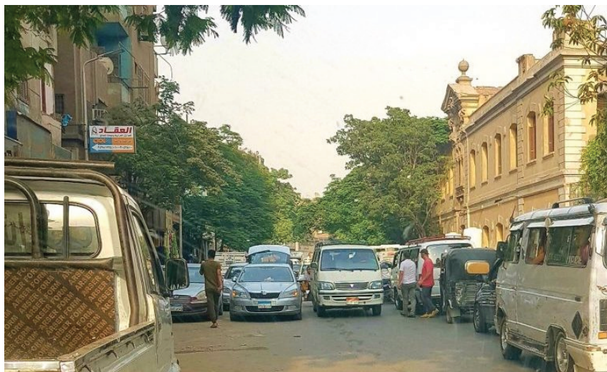
Typical traffic congestion in Cairo, as pedestrians, commuters, and standing traffic vie for space.

of the drivers accepted my claim that I was visiting Cairo from my hometown of Alexandria, where I was born and raised until my family chose to emigrate in my youth. I would then share that I was living in Toronto, Canada and was visiting to collect sources for my research. Every driver, without fail, would then relate how he had a friend or relative in a North American city and plans to emigrate.