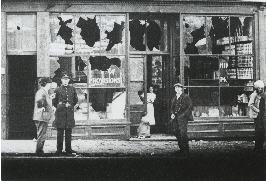
Building damaged during Vancouver riot of 1907 - 130 Powell Street.

On Saturday 7 September 1907, Vancouver was gripped by one of the largest race riots in Canadian history. This event started with a large gathering of people who also marched on City Hall, in that case behind a banner that said: “Stand for a White Canada.” 1 After listening to fiery speeches against Asian immigration, a significant number then headed to Chinese and Japanese neighbourhoods in the city, where they wreaked extensive property damage, physical violence, and terror.