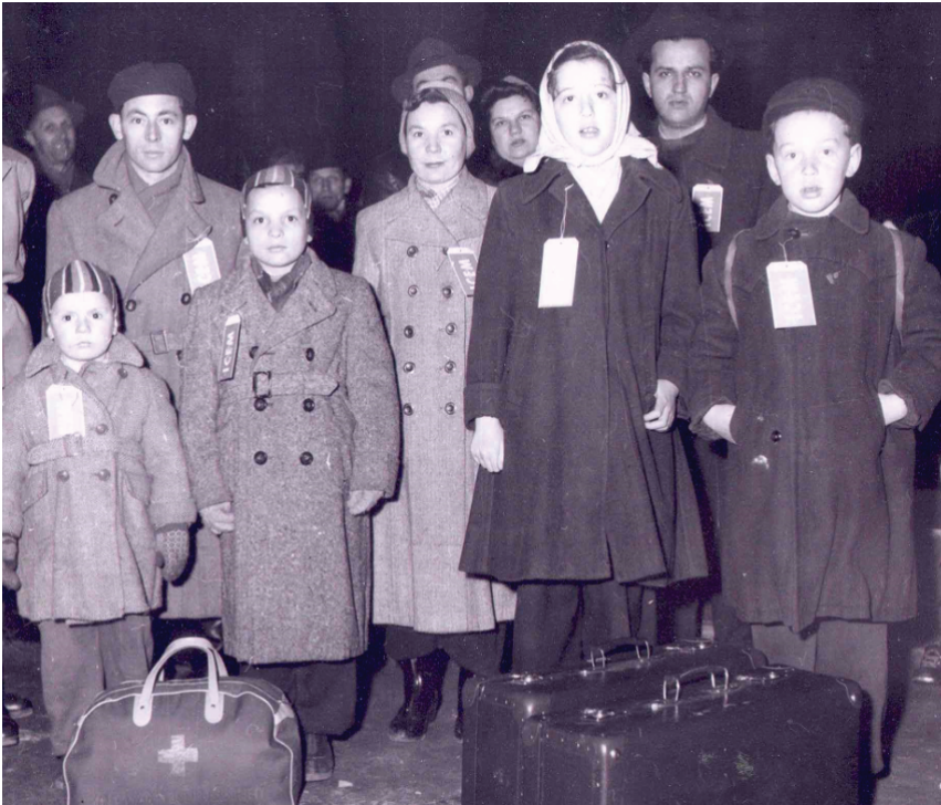
Hungarian Refugees arrive in Canada, 1957.

gary by train and horse-led wagons to come to Canada in April of 1951, but not before spending six years stateless in Austria. They were among the more than 120,000 refugees who made their way to Canada between 1947 and 1953, thanks to contract labour schemes or government, family or church group sponsorships. Make no mistake, the selection criteria were guided by racial and political bias, along with a heavy dose of economic self-interest.