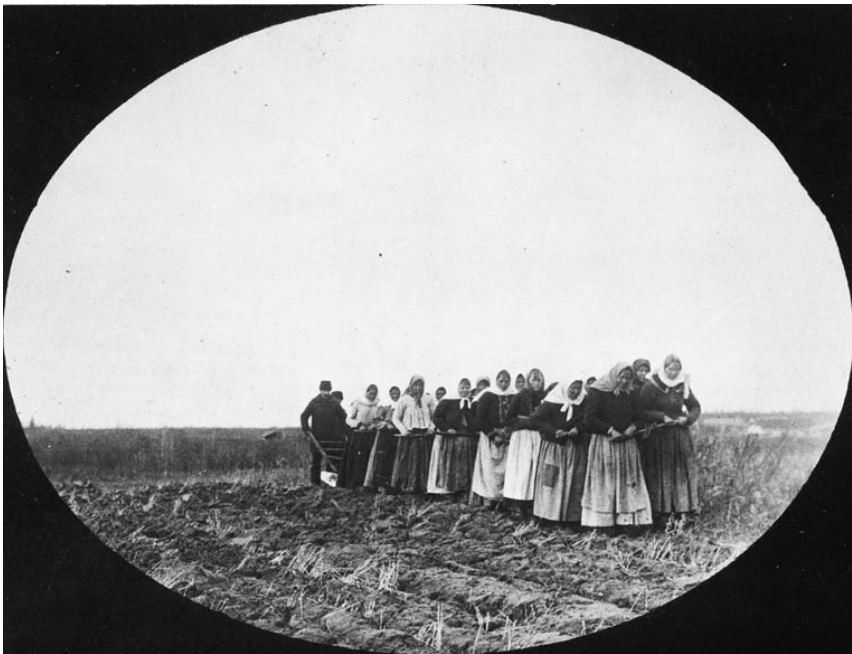
Doukhobor women, Thunder Hill Colony, Manitoba (ca. 1899). Library and Archives Canada, C-000681.

that morally superior angel in the home. Consider too the distinctive dress of the women who completed the portrait of Immigration Minister Clifford Sifton's ideal Eastern European peasant "in a sheepskin coat" with "a stout wife and a half-dozen children" grudgingly welcomed to Canada. Someone needed to do the backbreaking labour to settle what was portrayed as an empty Prairie, the original First Nations inhabitants having been relegated to reserves. Even Icelandic pioneer women, easily assimilated, one might expect, into the Nordic race, were castigated for their typical headdress: a dark knitted skullcap with tassel. Such women may now be considered Old Stock Canadians, but not so long ago, their Anglo neighbours viewed them as second-class. According to historian Sarah Carter, Anglo women's organization in Alberta thought Ukrainian girls so deficient in the standards of proper womanhood that they too should be sent to residential schools.