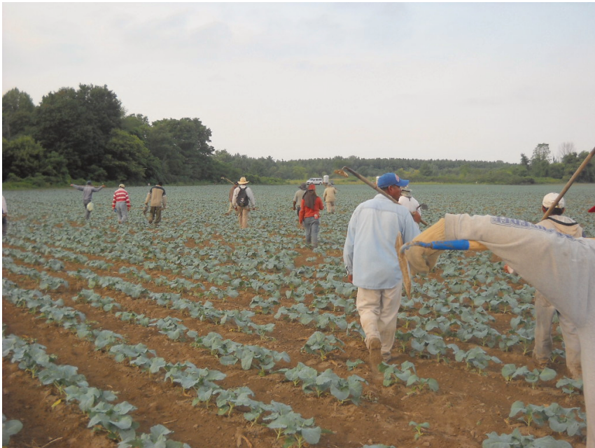
Returning to the vans at the end of the day, August 2010.

bunkhouse. The farmer had it timed so that we would depart exactly 45 minutes before sunrise, driving through the dark in order to arrive right as the sun's first light streamed across the field, allowing for maximum production during the daylight hours. Some days we would work until dark before returning to the bunkhouse. Workers often took advantage of the long drives to sneak in a few more minutes of sleep, sometimes leaving the driver as the only person awake in the van. Fortunately, he was not shy about blasting norteña music to keep himself awake, napping coworkers be damned.