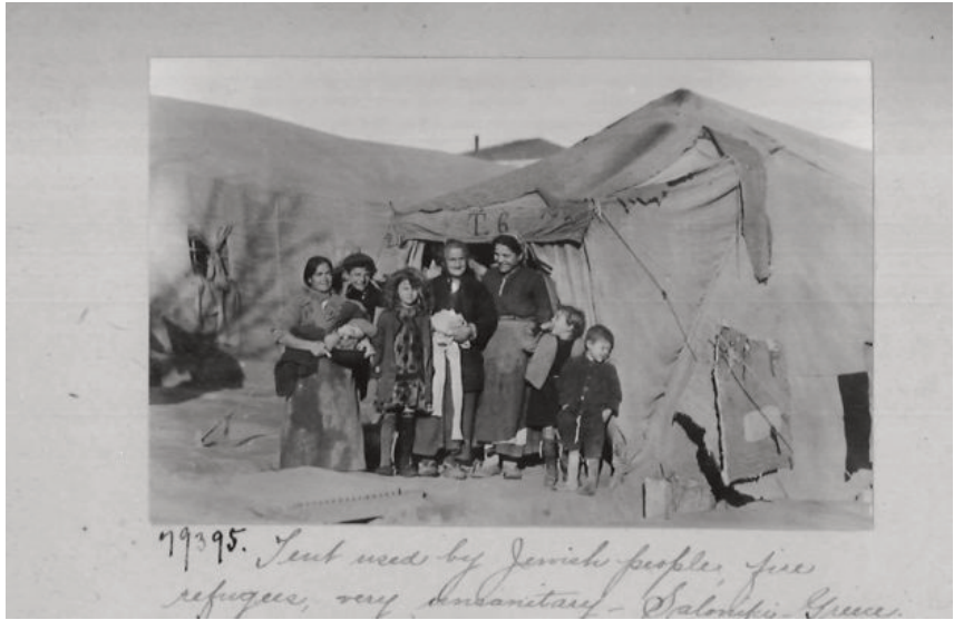
Image 2 "Tent used by Jewish people, fire refugees, very unsanitary. Salonika, Greece." Lewis Hine, 1919. (GCAH-79375)