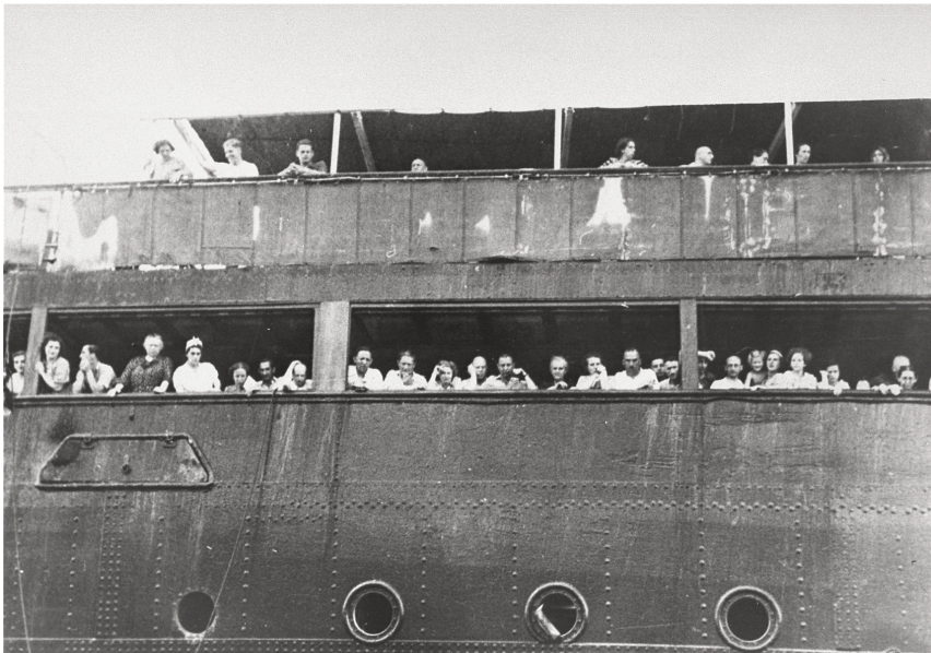
MS St. Louis in Havana, 1938.

In our minds the contradiction is striking and not easily dismissed. How is it that antisemitism can be a quotidian part of life in Canada while the country is also associated with being a place of refuge? How did this fundamental contradiction come to be and what are the implications for the present and future? Part of the answer lies in the ease with which politicians can speak in morally righteous terms when apologizing for historical wrongs and the gulf that often exists between the symbolism of their words, their actions, and the lived experience of those most affected by the subject and substance of their apologies.