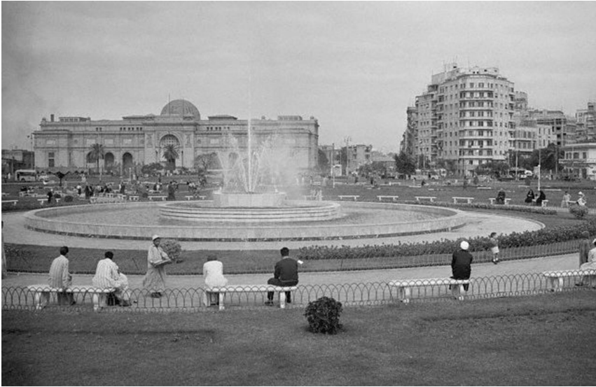
Cairo's Tahrir Square, mid-1900s.

the expectations of those wishing to emigrate have all changed in the past sixty years.