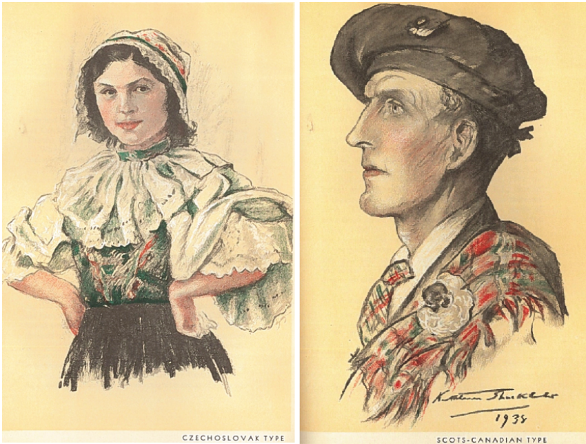
John Murray Gibbon, Canadian Mosaic (1938).

In order to create this ideal Canadian, Gibbon praised only very specific ethnic traits and traditions, ones that he believed would fit into his definition of Canadian national identity. This can be seen most clearly not in what he included in Canadian Mosaic , but rather what he did not. He discussed a large number of “racial groups”, but every single one hailed from Europe. Asian immigrants, Aboriginal peoples, and people of African descent were completely absent from Gibbon’s definition of belonging in the northern nation.