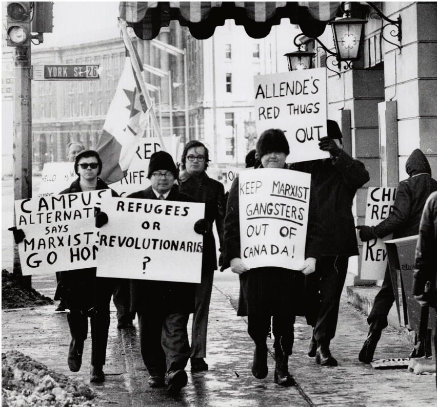
Protest against Chilean refugees, Toronto.

By mid-1979, nearly 1.5 million refugees had fled their homes in Southeast Asia. In June of 1979, the Canadian government announced that 60,000 Indochinese refugees would be resettled by the end of 1980. Thousands of Canadians came forward to welcome refugees, giving a dramatic launch to the new Private Sponsorship of Refugees Program. Popular pressure forced the government to adjust upwards its initial commitment to resettling the refugees. For the years 1978-81, refugees made up 25% of all immigrants to Canada.