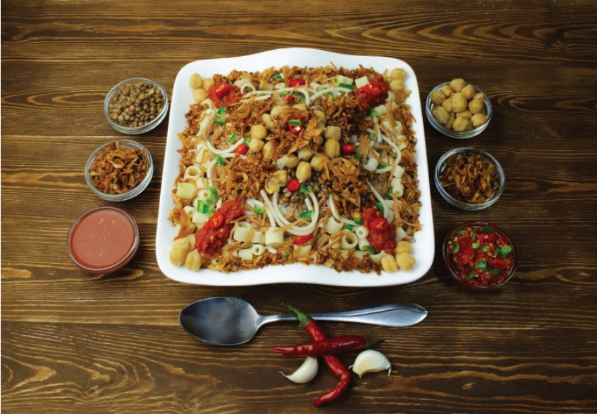
Kushari is made of rice, macaroni, and lentils mixed together, topped with tomato-vinegar sauce, garnished with chickpeas and crispy fried onions and sprinkled with garlic juice and hot sauce.

kitchens and mosque and church festivals. This dish, central to my own memories of 'home', remains confined to the familial private sphere and community cultural festivals.