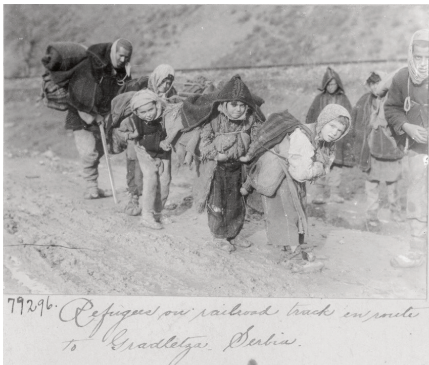
Image 1. "Refugees on railroad track en route to Gradletza, Serbia." Lewis Hine, 1919. (GCAH-79296). (These handwritten captions are in Hine's own hand)

diately following the Great War. The ARC hired Hine because of his reputation as America's foremost photographer of social reform issues. Hine had trained as a sociologist and an educator. He was not a journalist, but rather a social reformer whose main medium of advocacy was the camera. By the mid-1910s, Hine had developed a reputation as "the most extensive and successful photographer of social welfare work in [America]." 2 During the First World War, his positive portrayals of refugees served the ARC well in their development as America's foremost relief agency .