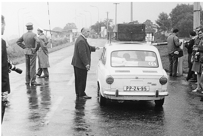
On the outskirts of Bratislava, a family prepares to cross the border into Berg, Austria (August 1968). International Organization for Migration (IOM).

democratic values and refused to live under a totalitarian regime. Many resettled in the West in the hopes of liberating their homeland from communism. At the height of the Cold War, when Canadians were overly vigilant against the arrival of undesirable individuals from the Eastern Bloc, federal officials were keen to admit anti-communist Czechs and Slovaks who had fled from the events of 1948. These newcomers were often celebrated by the Canadian public as ‘freedom fighters,’ but also mistrusted as potential communist sympathizers or spies.