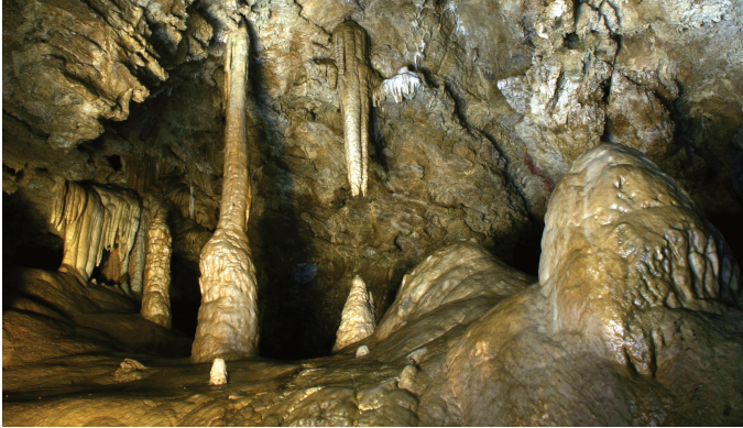
Orca Millers Chapel

Many people like to climb to the tops of mountains in Oregon. However, some people like to go inside a mountain. They like to explore the Oregon Caves.