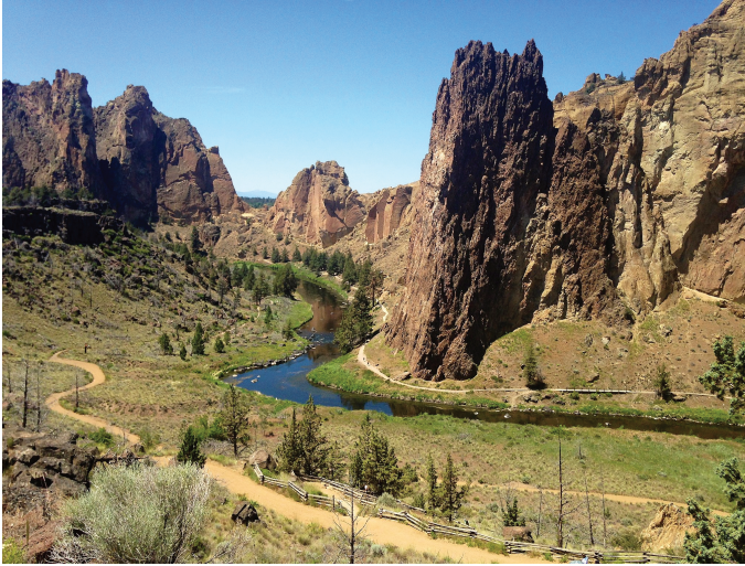
Smith Rock in the afternoon

Do you like rock climbing? Smith Rock is in the high desert of Central Oregon. It is a very popular park. People like to climb its rocky cliffs and towers. It has 623 acres, and there are many animals, such as eagles, mountain lions, and deer.