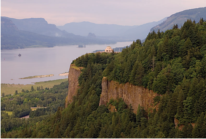
Columbia River Gorge

The Columbia River Gorge separates the states of Oregon and Washington. The word gorge is another name for a canyon. It is a deep valley between hills or mountains. A gorge usually has high walls and a river running through it.