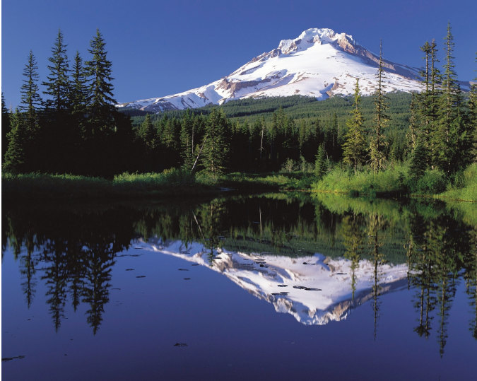
Mt. Hood Reflected in Mirror Lake

Mount Hood is a famous place to visit in Oregon. You can see the mountain from many places in the state. It is about 50 miles from Portland. You can drive from the city to the mountain in about one hour.