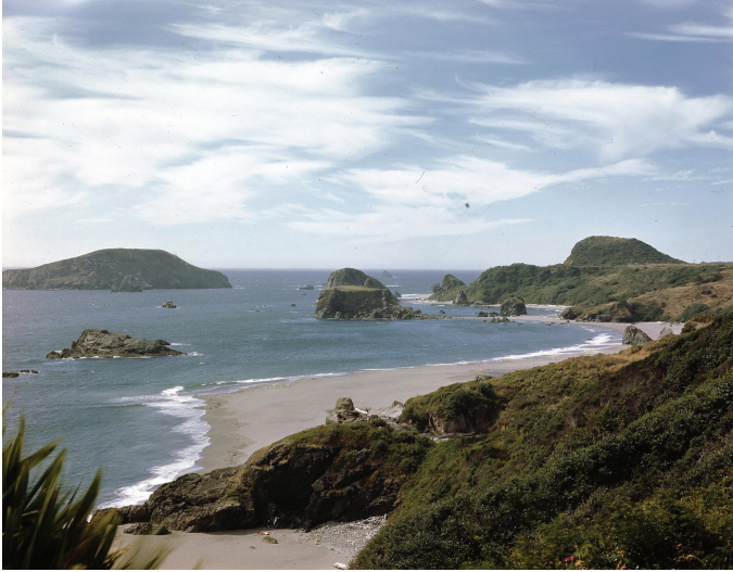
Oregon coast taken from Highway 101 near Brookings

Imagine: the year is 1913. Oregon is a young state. It is only 54 years old. Railroads are bringing more people to the Oregon Coast. Some are only visitors on vacation. Others, however, want to buy land next to the ocean. It is a race to see and build new things. What will happen?