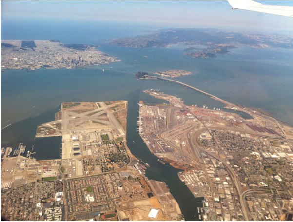
San Francisco, US.

40. The main force which shapes human settlements physically is centripetal—that is, the inward tendency towards a close interrelationship of all its parts.