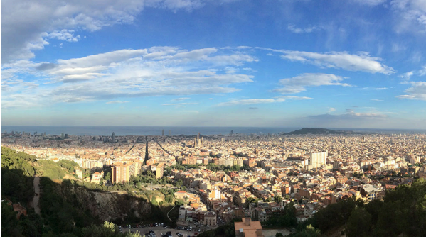
Barcelona, Spain.