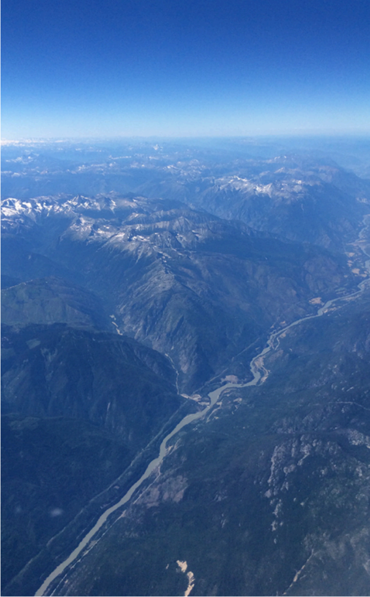
British Columbia, Canada