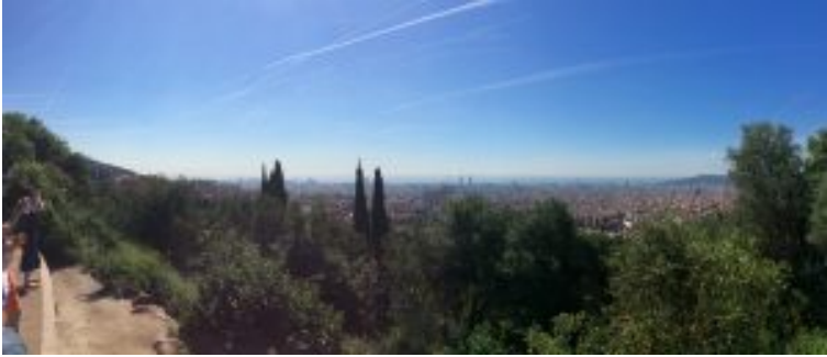
Barcelona, Spain.