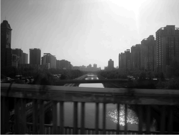
Beijing, China.

Countless people have inspired, informed and supported this book—some more directly than others, but all equally important. That being the case, I have to apologize in advance for not being able to name everybody individually. For those I miss, hopefully