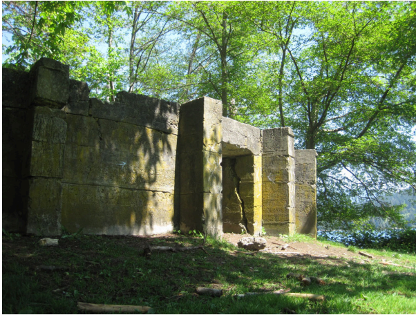
North Vancouver, BC, Canada.

15. The gradual death of a settlement begins when the settlement no longer serves and satisfies some of the basic needs of the its inhabitants or of the Society, in general. As people move they carry their values with them.