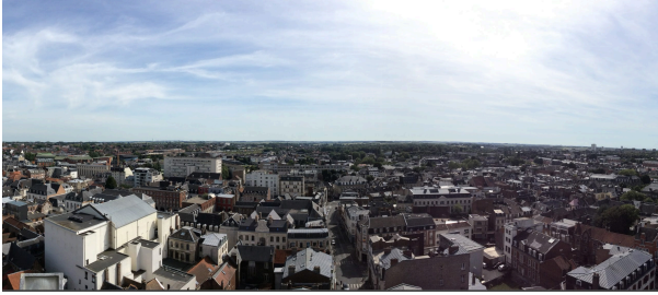
Arras, France.