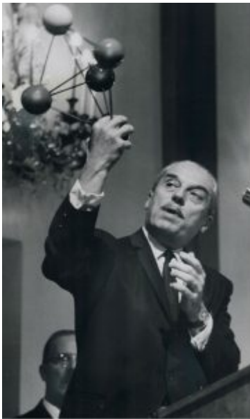
Constantinos Apostolou Doxiadis, 1967.

These works alone are enough to warrant labeling those decades as a golden age of insights around human settlements, but I beg your indulgence by adding a few more for good measure: Aldo Rossi's The Architecture of the City (1966), Robert Venturi and Denise Scott Brown's Learning from Las Vegas (1972), Edward T. Hall's The Hidden Dimension (1966), and Gordon Cullen's Townscape (1961), Jan Gehl's Life Between Buildings (1971), Henri Lefebvre's sharp The Production of Space (1974), and Oscar Newman's Defensible Space (1972). Each of these continues to be extremely influential in their respective fields.