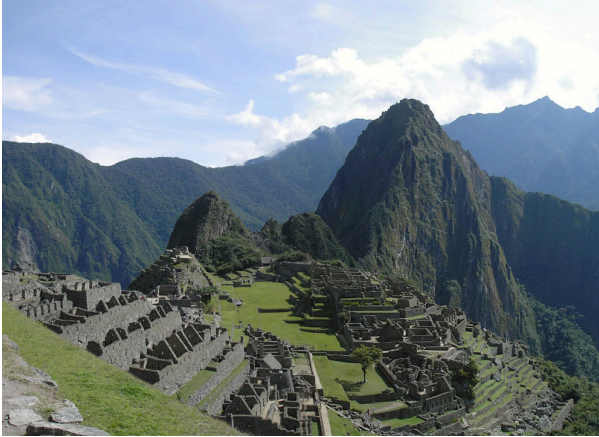
Machu Picchu, Peru.

30. The functions of a settlement depend on the geographic and topographic location, geologic conditions, technological development, population size, and the role within the larger settlement system.